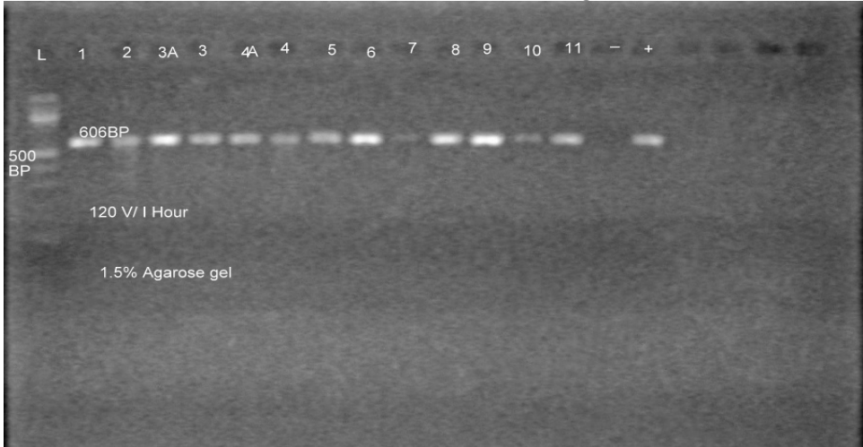
Figure 2: Salmonella enterica gene detection, 606bp detected (iroB gene detection)

For the iroB gene detection, the results showed that all eleven (11/11) samples were confirmed to be Salmonella enterica spp, with 606 bp detection Fig.2.