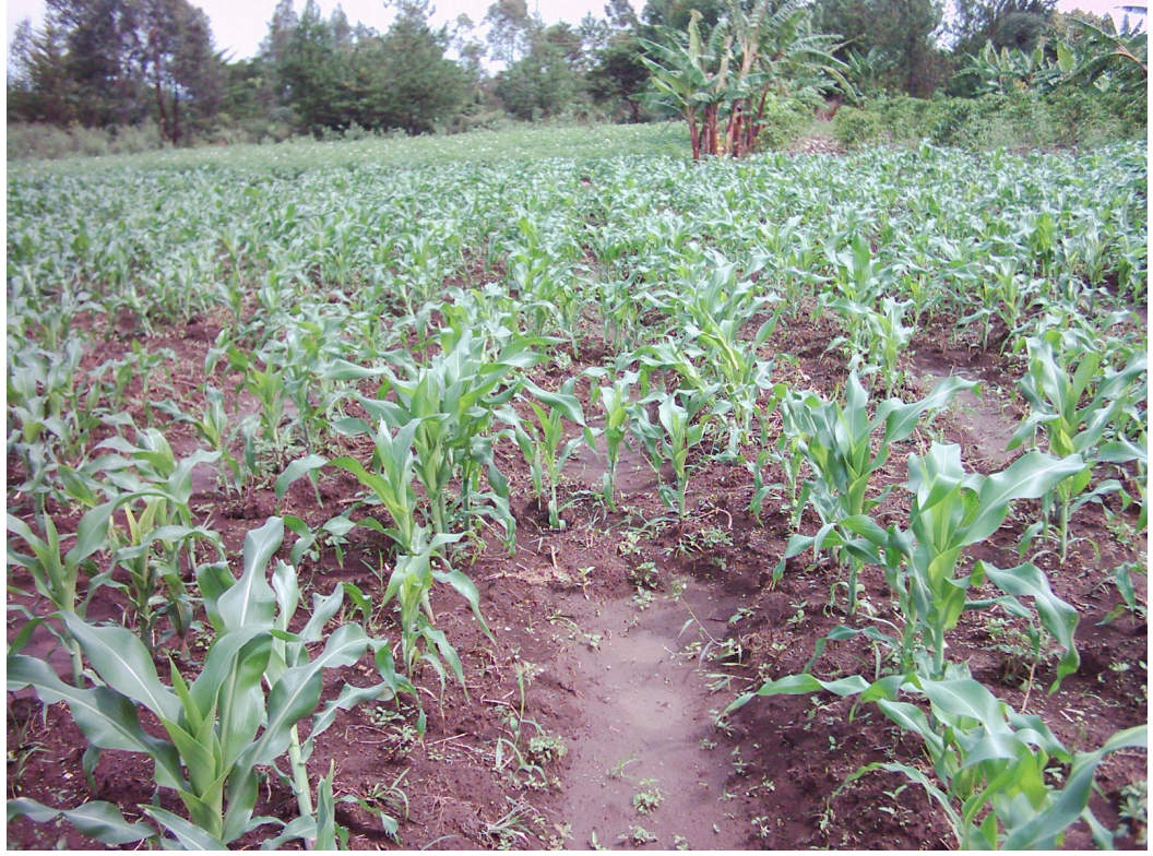
Figure 1: Trapping of water, soil and nutrients insitu on the field by cross-ridges

use of best agronomic practices, including improved bean varieties. Partitioning of the effects in earlier work by Malley et al. , (2009) showed that, soil fertility improvement alone contribute about 46% to increase in yield. In this promotion work, increases in bean yield ranges from 128-257% averaging at 174%. This was