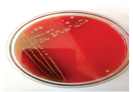
Figure 1: Colonies of Bacillus sp. isolate TM07 on blood agar

Upon purification of the Bacillus spp. isolates on NA, 17 samples gave rise to gravish mucoid colonies which were, roundish and wrinkled; suggestive of Bacillus spp. On BA, scanty hemolysis was present around the colonies (Fig. 1). Smears from the colonies showed rod shaped gram positive bacteria in short chains (Fig. 2). Furthermore, the cultures tested catalase and oxidase positive. These isolates were then tested for antagonism against F. oxysporum