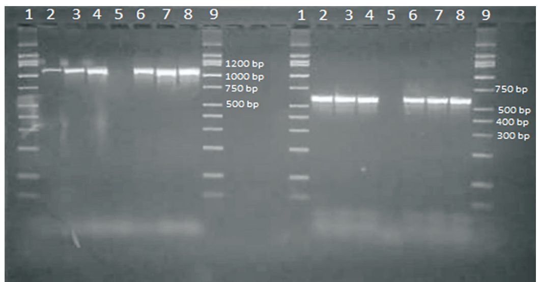
Figure 5: Two agarose gel electrophoreses of PCR products of Bacillus sp. (TM07) showing characteristic bands size 1114bp (left) and 600bp (Right) for genus and species level identification respectively. Lanes 1 and 9 are DNA markers; Lanes 2, 3 and 4 are the PCR product of bacteria isolate TM07; Lane 5 is distilled water (negative control); Lanes 6, 7 and 8 are DNA samples of Real Bacillus SC® (positive control)

P < 0.05, df = 42 Co3^* Control isolate Bacillus subtilis - Real Bacillus SC®