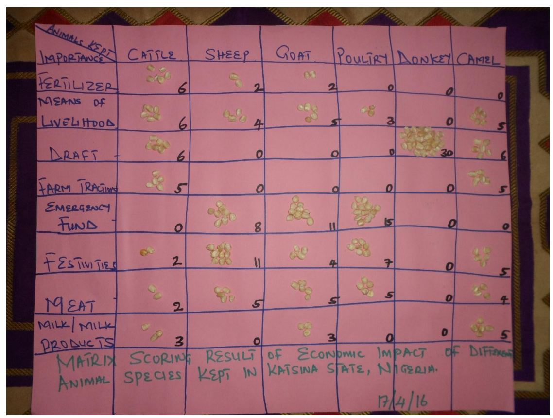
Plate II: Matrix scoring for economic impacts of animal species kept by pastoralists in Katsina State, Nigeria.