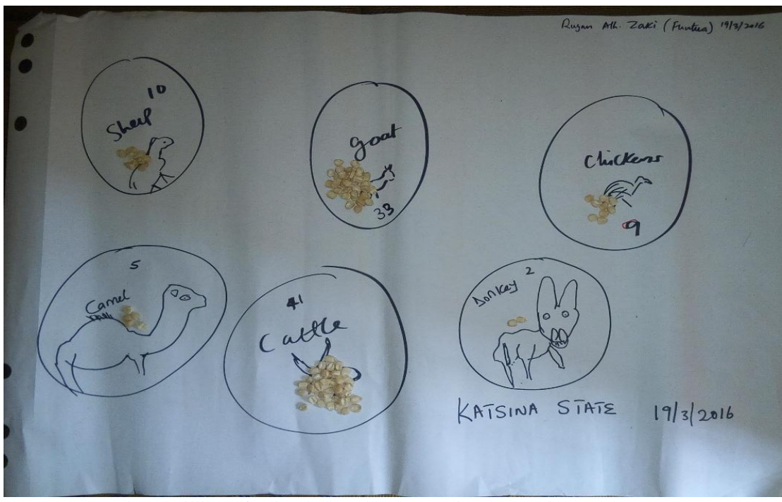
Plate I: Proportional pilling of animals kept by pastoralists in Katsina State.