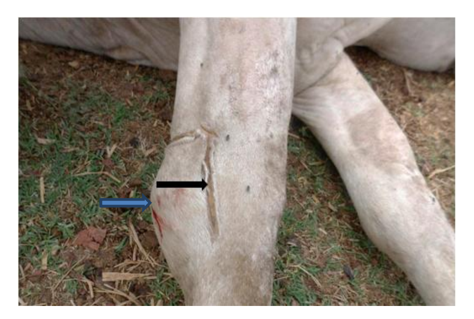
Plate III: Hygroma (blue arrow) and mark due to firing on the left knee (black arrow) as a method of treatment of brucellosis in cattle in Zamfarawa village in Bakori LGA of Katsina State