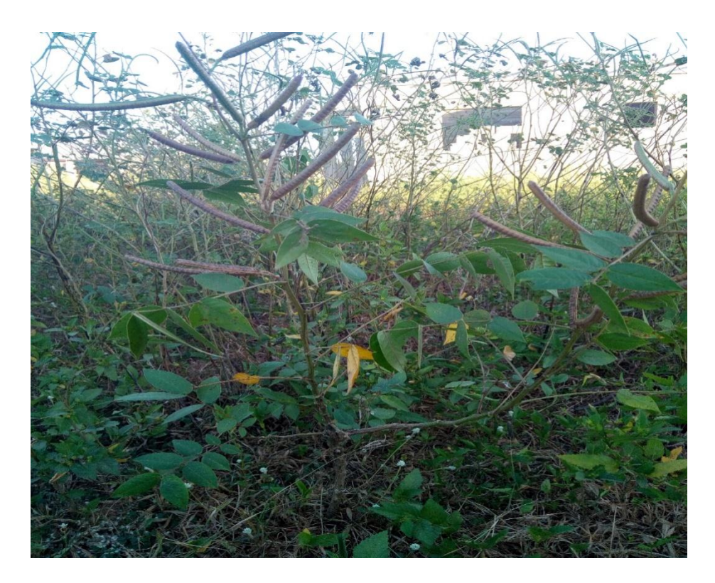
Plate IV: 'Rai dore' ( Senna occidentalis ), plant with the leaf (arrow), which is used for traditional treatment of brucellosis in Rafin Kanya Ward of Funtua LGA of Katsina State