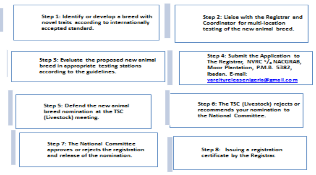
Step by Step Procedure to Register an existing or new animal breeds in Nigeria. Source: (NACGRAB, 2016; 2017)