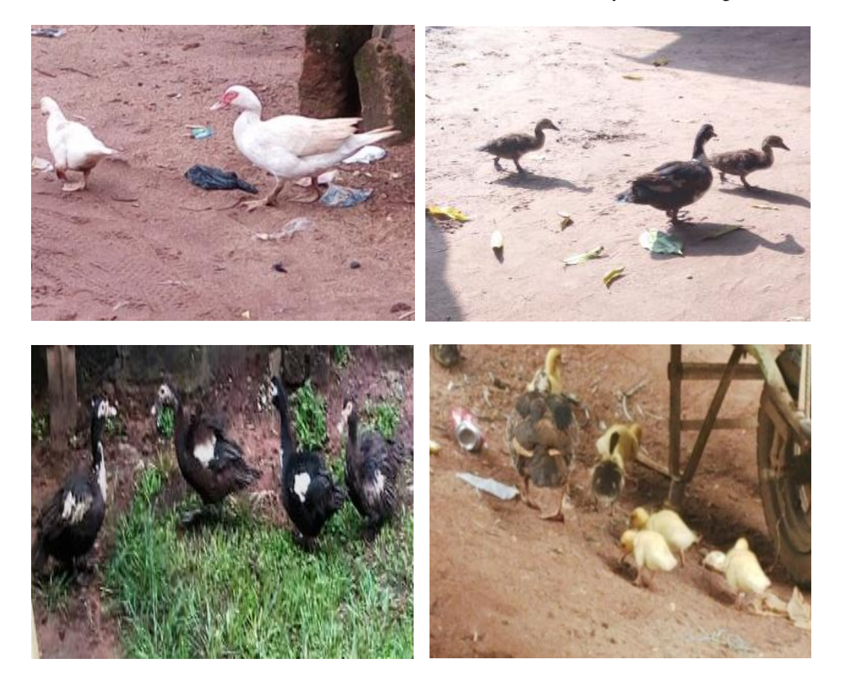
Fig: 2 Variation among ducks of southeast ecological zone, Nigeria

such as caruncle colour, bill shape, bean colour and crested. Although caruncle colour was red, caruncle colours in males were brighter and more prominent than in females were it was smaller and dull in colour. This result is in agreement with the findings of (2) and (18) that reported red colour as the predominant caruncle colour among Nigerian ducks. This results are equally at variance with (2) that reported black as the predominant bean colour among Cambodian ducks while (18) reported absence of red, brown and white bean colours in rainforest Muscovy ducks of Nigeria.