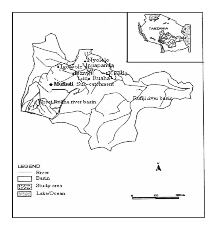
Figure 2: Map showing the Little Ruaha Basin Mufindi District Tanzania

relationship between pairs of variables. The economic benefits were assessed by using gross margin analysis. Food available for consumption as an indicator of food security was used to assess food security at the household level. Contingent valuation technique was applied to assess the value of wetlands services; and linear regression analysis was used to determine the factors that influence utilization of wetlands resources.