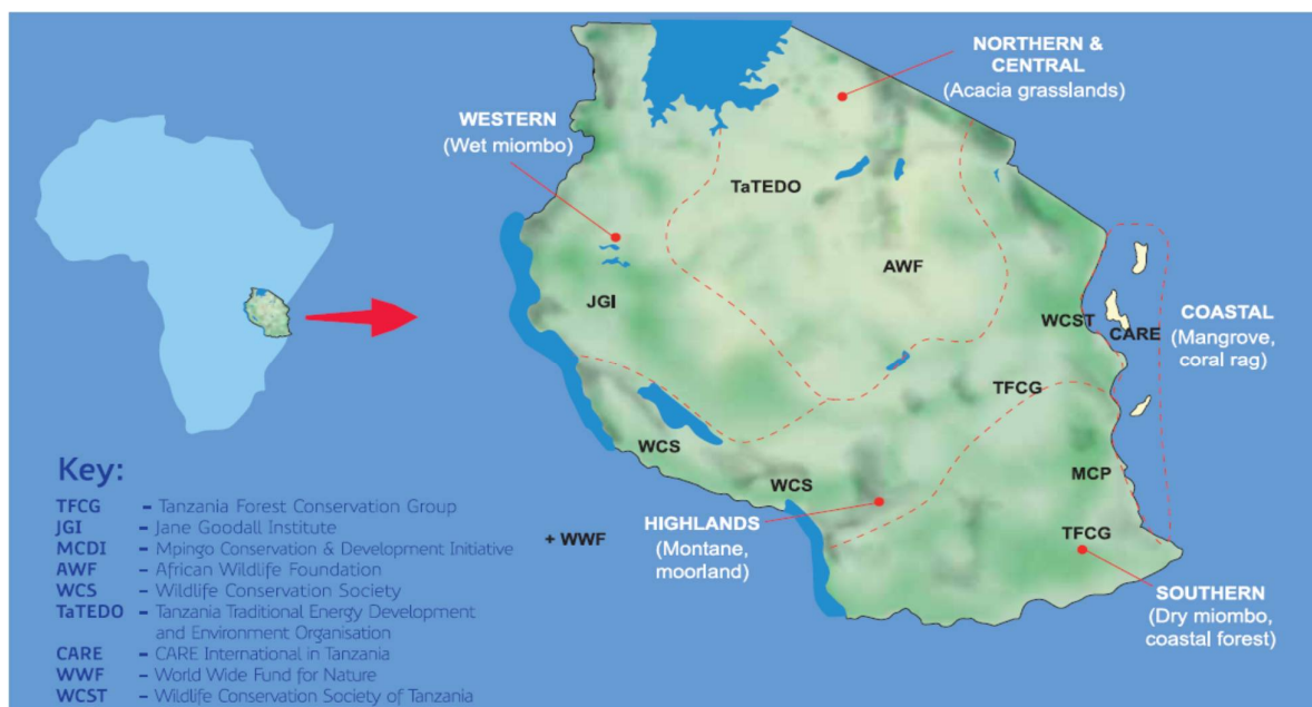
Figure 1: National REDD+ Pilot Projects in Tanzania