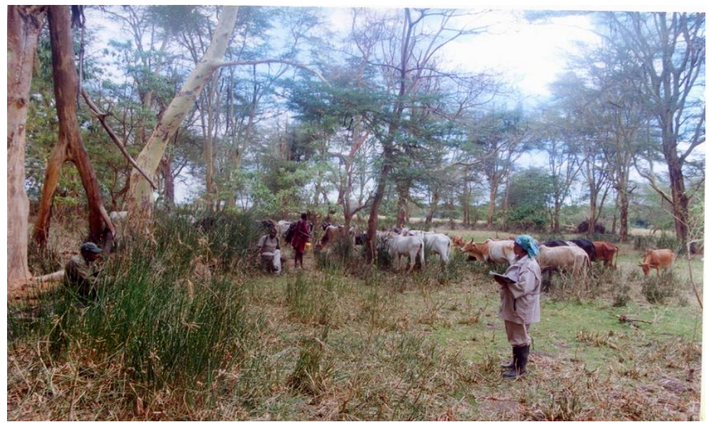
Plate 1: Illegal Grazing in Selela Village Land Forest Reserve

gene pool. Similar observation was reported by Munishi et al. (2002). Consequently, if this situation continues without any measures being taken the ecological function of this forest will be jeopardized. Similarly, the VNRC has no decision making powers as reported by 60% of the interviewed respondents. If the powers transferred by the state to low level of authority are not used democratically, environmental injustice emerges. Plate 1 shows rampant grazing in SVFR.