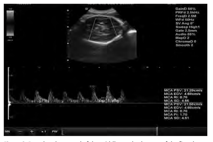
Figure 3: Doppler ultrasound of the middle cerebral artery of the first donor twin showing normal Doppler indices

II (donor twin) also weighed 2.25 kg with Apgar score of 8<sup>1</sup> 9<sup>5</sup>. Both babies were discharged home on the fourth day of life.