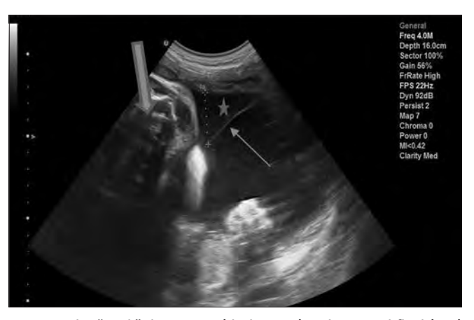
Figure 2: The "stuck" donor twin (thick arrow) with minimal fluid (star) around it. The DVP was 2.2 cm. The thin amniotic membrane (thin arrow) is seen to separate the two fetuses