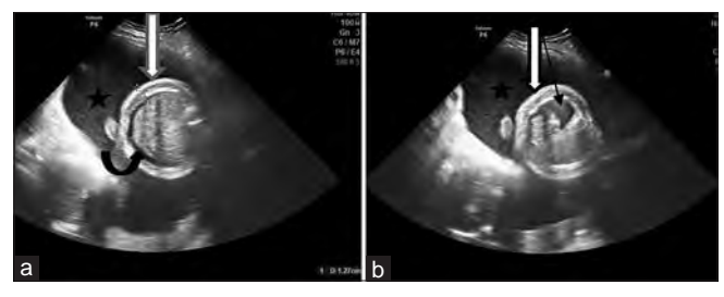
Figure 4: (a) Transverse view of the recipient through the abdomen showing skin edema (block arrow) and free fluid (ascites) within the abdomen (curved arrow). Increased amniotic fluid (star) is noticed around it. (b) Transverse view through the thorax showing skin edema (block arrow) as well as pericardial effusion (thin arrow)

Three types of anastomoses have been documented in monochorionic twin pregnancies: from artery to artery (AA), from vein to vein (VV), and from artery to vein (AV). AV anastomoses are unidirectional and are referred to as "deep" anastomoses since they proceed through a shared placental cotyledon, whereas AA and VV anastomoses are bidirectional and are referred to as "superficial" since they lie on the chorionic plate. AV anastomoses are found in 90%–95% of MCDA pregnancies, AA in 85%–90%, and VV in 15%–20%. TTTS is caused by net imbalance of blood flow between the twins due to AV anastomoses.<sup>[8-10]</sup>