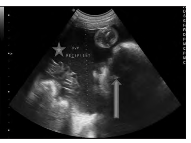
Figure 1: The recipient twin (block arrow) with increased fluid (star) around it. The deepest vertical pool was 11.1 cm

The patient was referred to the emergency unit of the antenatal clinic where she was scheduled for an emergency lower segment caesarean which was done the same day. She was delivered of two live male neonates. Twin I (recipient twin) weighed 2.25 kg with Apgar score of 6<sup>1</sup> 9<sup>5</sup>, while twin