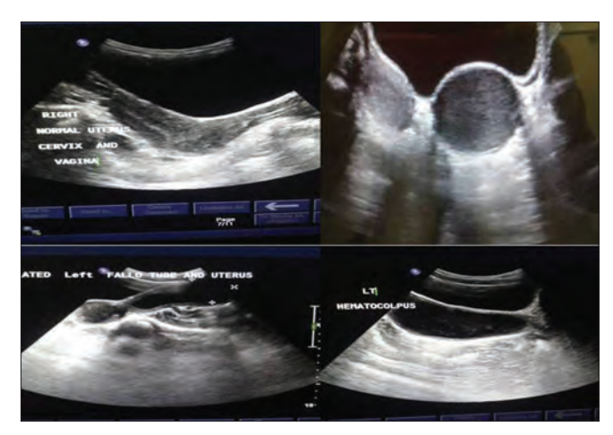
Figure 1: USG findings

can diagnose this condition, MRI plays an important role in further characterizing the didelphic uterus, obstructed hemivagina, and ipsilateral renal agenesis.<sup>[1]</sup> Laparoscopy remains the gold standard diagnostic modality for uterine anomalies with the additional therapeutic advantages.