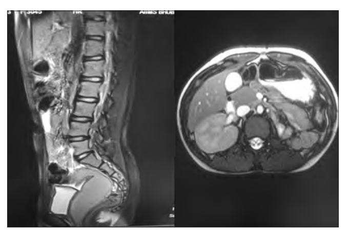
Figure 2: MRI findings