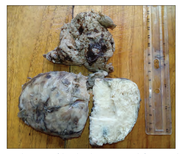
Figure 2: Schwannoma of the vulva: The mass consisted of an encapsulated grey brown firm mass with a white fleshy cut surface