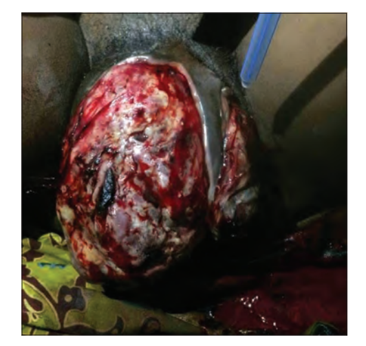
Figure 1: Vulva schwannoma: There was ulceration of the vulva and protrusion of a large oval mass which extended to involve the lower part of the vagina at presentation in the hospital

Mesenchymal tumors in the female reproductive tract range from the commonly occurring leiomyoma to rarely encountered lesions.<sup>[2]</sup> Mesenchymal tumors in the vagina and vulva regions are not common, especially when compared with epithelial neoplasms.<sup>[3]</sup> Those of neural origin are still a much smaller subset. Schwannomas which arise from the neural sheath are only rarely encountered in gynecological practice and a few cases have been reported.<sup>[4,5]</sup> Table 1 below shows some cases involving the vulva and adjacent structures reported in the literature.<sup>[1,6-26]</sup> Presented on this table are some important features including the age of the patient, duration of the swelling, histological subtype, specific site, size, and presence or absence of degenerative changes such as necrosis or cyst formation.