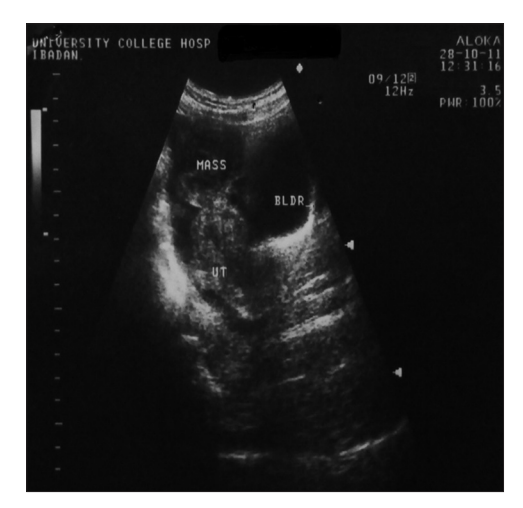
Figure 1: Transabdominal ultrasonography of the mid pelvis showing a complex mass adjacent the uterine fundus

confirmed to have hemoperitoneum at surgery. The negative predictive value for haemoperitoneum was, however, 40% [Table 2]. Concordance between surgical diagnosis (using intra-operative findings) and histological diagnosis was computed with a kappa of 1.00, implying total agreement between the surgical and histological diagnoses in the cases where surgical specimen was sent for histology.