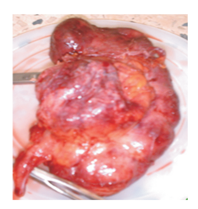
FIG 2: SPECIMEN