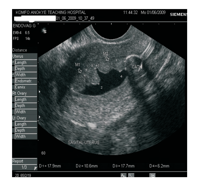
Figure 2a: Sagittal view showing dimensions of the bilobulated masses (M1 & M2).