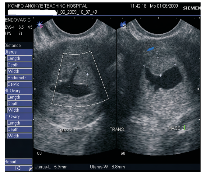
Figure 2b: Coronal views o f the bilobulated masses (Mass 1 and Mass2), under Doppler