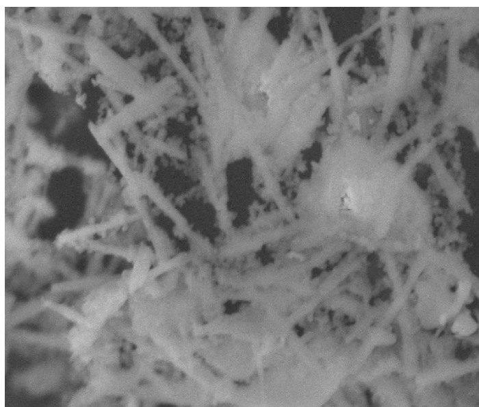
Figure 3: SEM micrographs of dried GONPs calcined at 400 °C (100 nm)

The high reaction temperature and sufficient time is favorable for the formation of large number of the cores in short time. The calcination of the production porous was useful to keep the porous shape [20]. The results are listed in Table 2 and it shows the variation of surface area, pore volume and pore size of GONPs with the calcination temperatures.