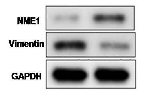
Figure 3: Effect of wortmannin on the expression of tumor genes

Exposure of BT-20 cells to wortmannin for 24 h induced changes in the expression of proteomes. The results from Western blot analysis showed increase in the expression of NME1 (NM23 H1) by wortmannin treatment (Figure 3). The expression of vimentin was significantly decreased by treatment with wortmannin (Figure 3).