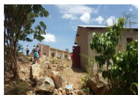
Settlement in the hill