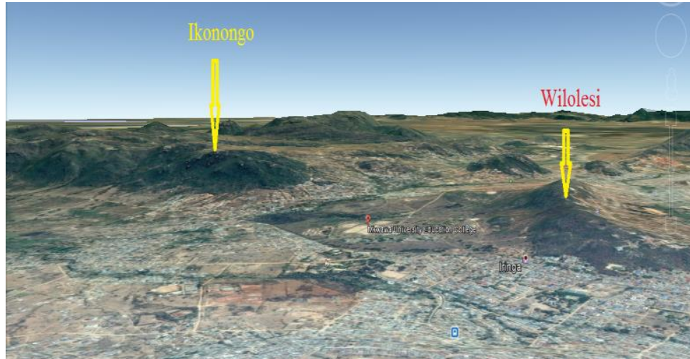
Figure 1: Study area (Source: Google Earth).