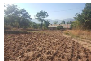
Farming in the hill