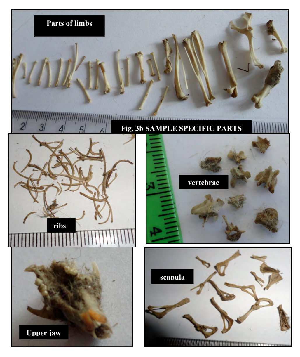
Figure 3a&b: Overall contents of owl food remains from a roosting site in the Serengeti short grassland plains, Tanzania. October 2012.

Lengths of limb parts varied significantly between pellets (Table 5; Fig 3; Corrected Bartlett statistic = 127.36, P < 0.0001; Kruskal – Wallis Statistic = 77.402, P ( \chi^2 approximation) < 0.0001). Significant (P <