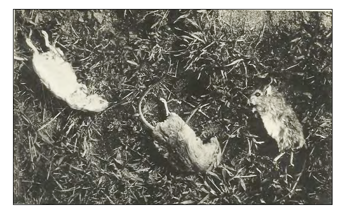
Figure 1: Drowned plains gerbils following heavy rains on the Serengeti plains, Tanzania, in 1974.

they eat. Basic data on limb lengths will make it easier to derive comparisons in future studies, both for species identification and on variations in the sizes of animals that the owls will be feeding on. Limb and skull characteristics are important standard morphometrics used in the identification of rodent specimens.