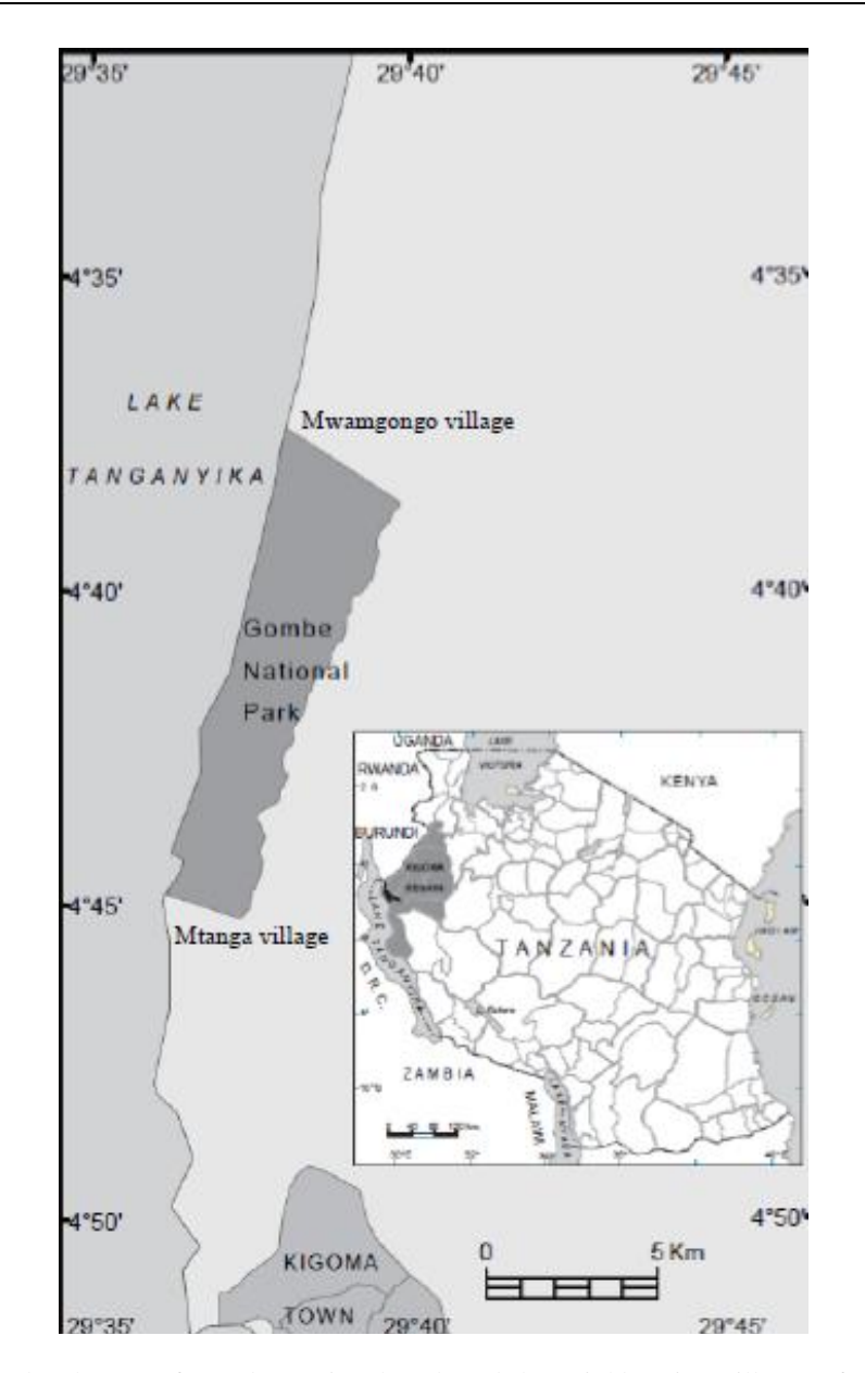
Bakuza - Distribution patterns of gastrointestinal parasites in vervet monkeys ...