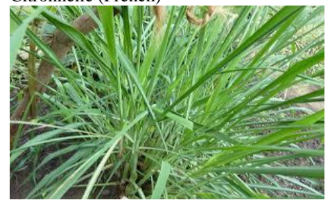
Figure 9: Leaves of C. nardus.