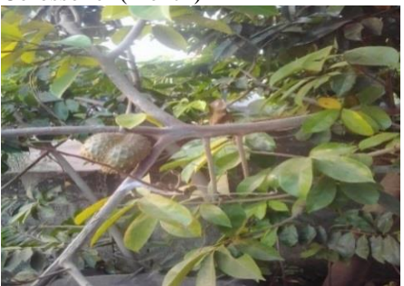
Figure 4 : Leaves, stems and fruits of A. muricata .