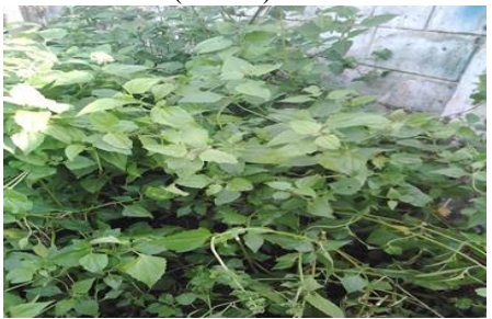
Figure 6: Leaves of C. odorata .