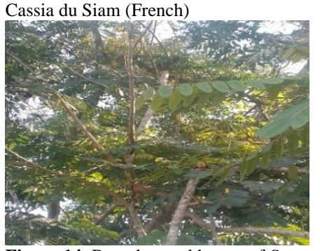
Figure 14 : Branches and leaves of S. siamea .

Kenu (Fon) Kassia (Yoruba and Goun) Cassia tree (English)