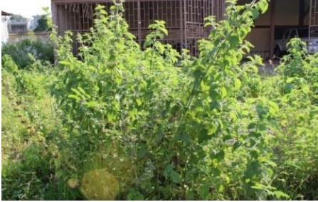
Figure 11 : Leaves and flowers of H. suaveolens .