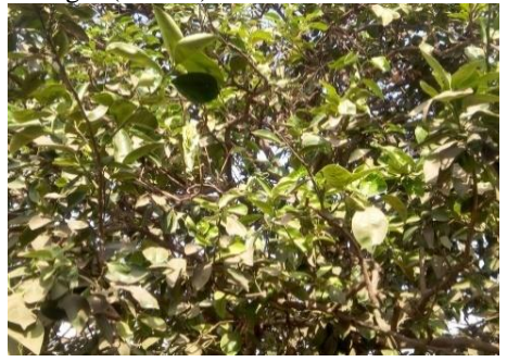
Figure 7 : Branches and leaves of C. sinensis .