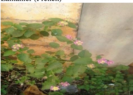
Figure 12 : Leaves, stems and flowers of L. camara .

Hlaciayo (Fon) Ewonagogo (Yoruba) Cherry pie (English) Lantanier (French)