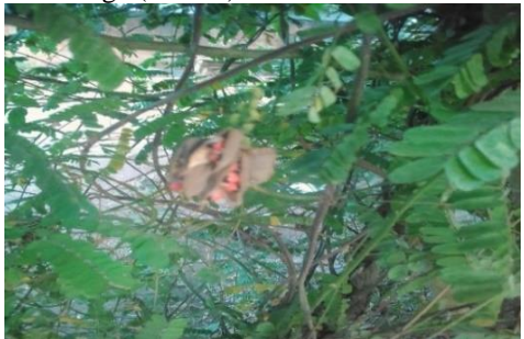
Figure 3 : Leaves, stems and fruits of A. precatoris .