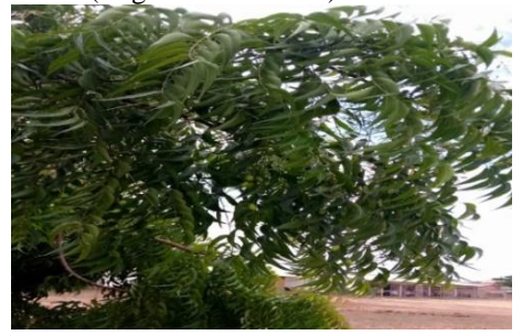
Figure 5 : Leaves and seeds of A. indica.

Dogonyaro, Egui lili (Yoruba and Nago) Neem (English and French)