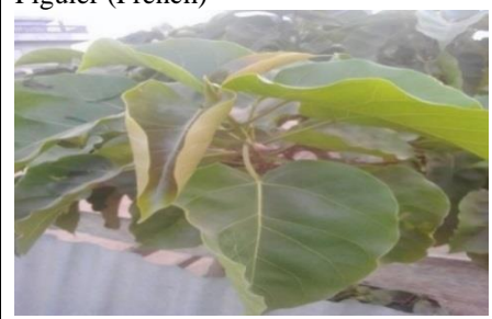
Figure 10 : Leaves of F. polita .