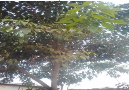
Figure 8 : Branches and leaves of C. adansonii .