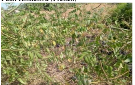
Figure 13 : Leaves and fruits of S. occidentalis .

Kinikiniba (Fon) Ganyitogle (Goun) Abo rere (Yoruba and Nago) Coffee senna (English) Faux Kinkéliba (French)