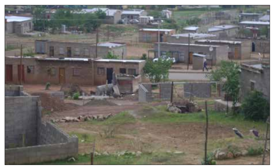
Figure 5: Unplanned, unregulated spatial development close to AGOA factories

market stalls. In general, however, there was a shared view that local authorities had not capitalised enough on, or benefitted enough from the presence of the AGOA factories, and had not used this platform to extend and upgrade services to the rest of their areas of jurisdiction. In defence of the local authorities, several of the interviewees indicated that, because AGOA had not led to broad-based economic growth, the continuing high poverty levels meant that many households still could not afford to pay for municipal services. They argued that this was the reason for the gaps and backlogs in service provision by the local authorities. One of the interviewees, who held this view, noted that, where