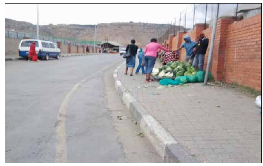
Figure 2: Street-level informal trading focused on workers in AGOA factories

With regard to local agricultural production, it was observed that there were instances of local people establishing and operating smallscale agricultural projects, producing primarily vegetables (notably tomatoes, green peppers, carrots and cabbages), chicken and eggs. The produce of these operations was not only sold to the factory workers, but also to street vendors and mini-bus taxi drivers serving