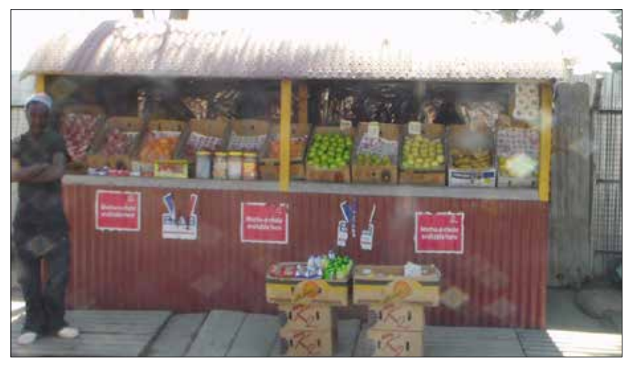
Figure 3: Informal trading in semi-permanent structures focused on workers in AGOA factories

the factory workers. These small farming operations provided work opportunities for inhabitants of the settlements where the factories were located as farm labourers, and for people from further afield in Lesotho.