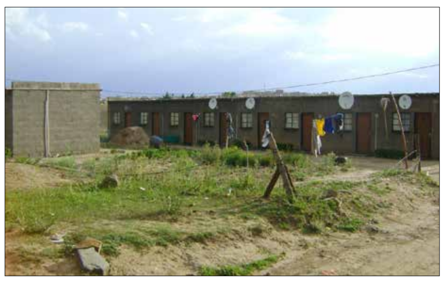
Figure 4: Housing units built for rent to workers in AGOA factories