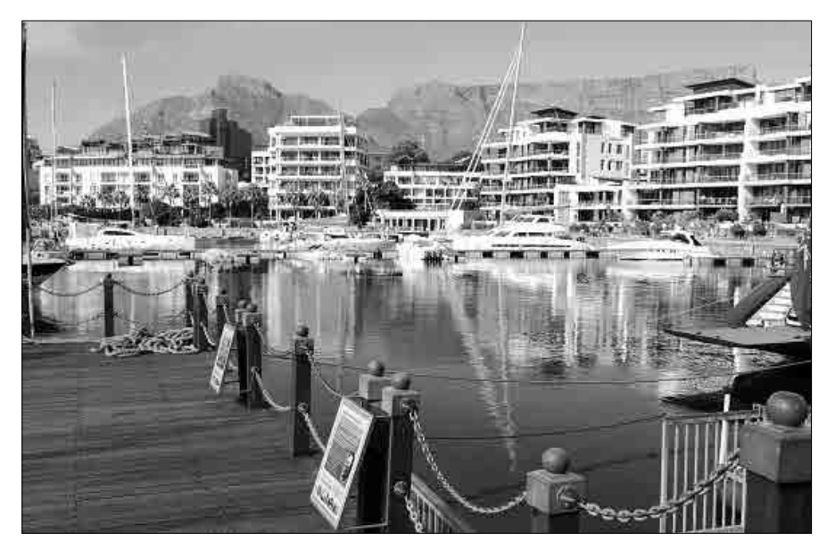
Figure 1: Cape Town residential waterfront development in a former quarry