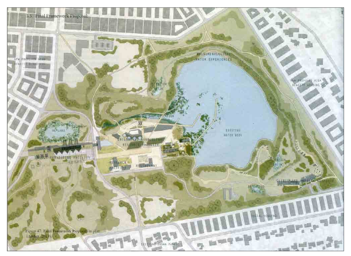
Figure 4: Proposals for the redevelopment of the Rosema and Klaver quarry in Monument Park, City of Tshwane