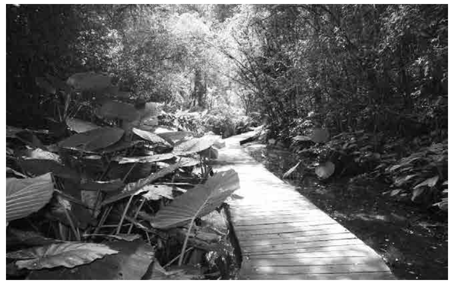
Figure 6: Boardwalk at the approach to the Bosque Zaninelli, Curitiba, Brazil