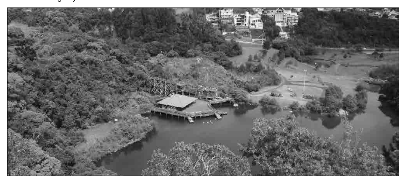
Figure 9: View onto the lake at the Parque Tanguá from the lookout, Curitiba, Brazil