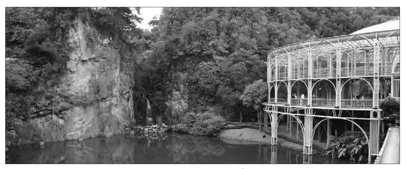
Figure 7: View onto the lake at the Parque das Pedreiras, with the Ópera de Arame (The Wire Opera House) to