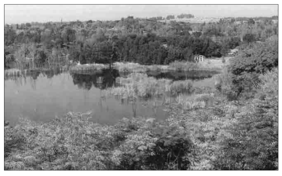
Figure 2: View over the post-industrial Rosema and Klaver quarry in Monument Park, City of Tshwane