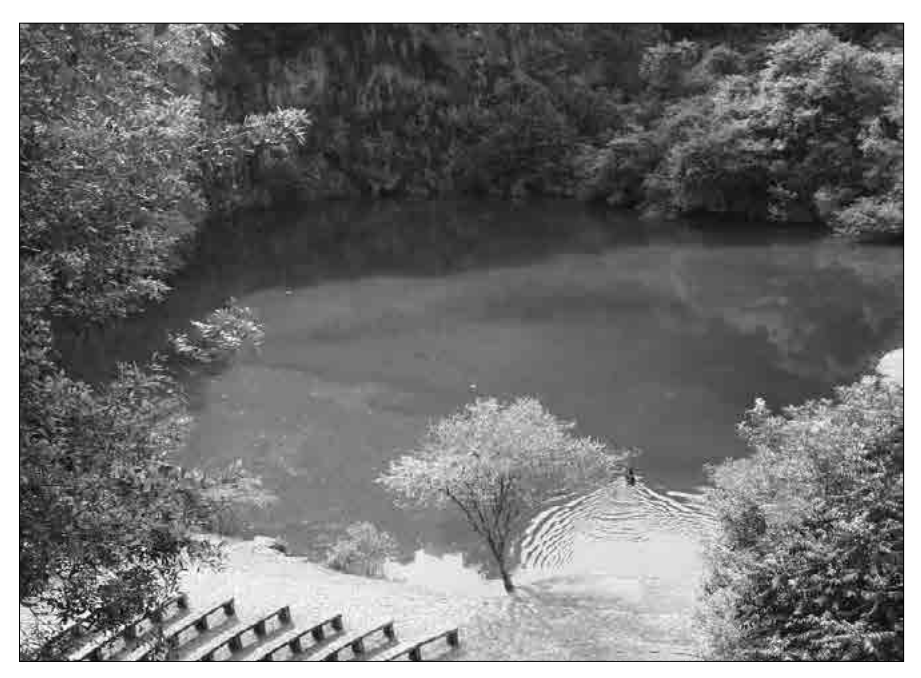
Figure 5: View onto the lake at the Bosque Zaninelli, Curitiba, Brazil

The need of urbanites to have access, for outdoor recreational purposes, to parks, natural areas and the 'wilderness' has been well documented. It has become difficult for urbanites to satisfy this need in places that are considered 'untainted' or 'natural wilderness', mainly due to distances they have to travel, their ability to do so and, more importantly, to find places that can still be defined as 'wilderness', based on the perceptions held at the end of the 19th century. From the literature survey, it is clear that human beings, specifically urbanites, have to re-evaluate their concept of wilderness; 'untainted wilderness' is at best a fallacy since, as Cronon (1996a) and Olwig (1996) argue, wilderness is a human construct and the natural values that human beings allocate to their environment do not originate from the physical nature, but from society.