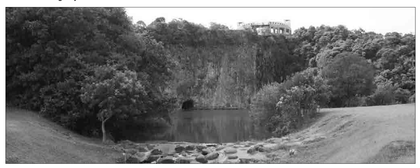
Figure 8: View onto the lake at the Parque Tanguá, with the lookout to the top right, Curitiba, Brazil