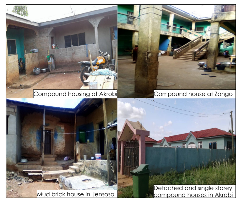
Figure 2:Housing typologies in the study communities

houses, the vast majority (62.4%) of them live in compound houses; 9.8% live in mud/brick houses. In this article, a compound house is a complete house (either single- or twostorey) buildings with several rooms, where tenants mostly share facilities and a common yard; tenants and their landlords stay together; facilities are either shared or exclusively used depending on the tenant/landlord agreement. Although compound housing is the vast majority (76.6%) in the Zongo community, makeshift structures such as kiosks and containers also prevail. Semidetached housing units are mostly rented by lower middle-income households. The tenants sometimes live in self-contained structures. i.e. rooms with kitchen, toilet and bathroom attached, although, in the study communities, most of the tenants in such rooms share toilets and bathrooms with other tenants in the houses. Although only 9.8% of the respondents stay in mud/brick houses, they are the most vulnerable in the various communities.