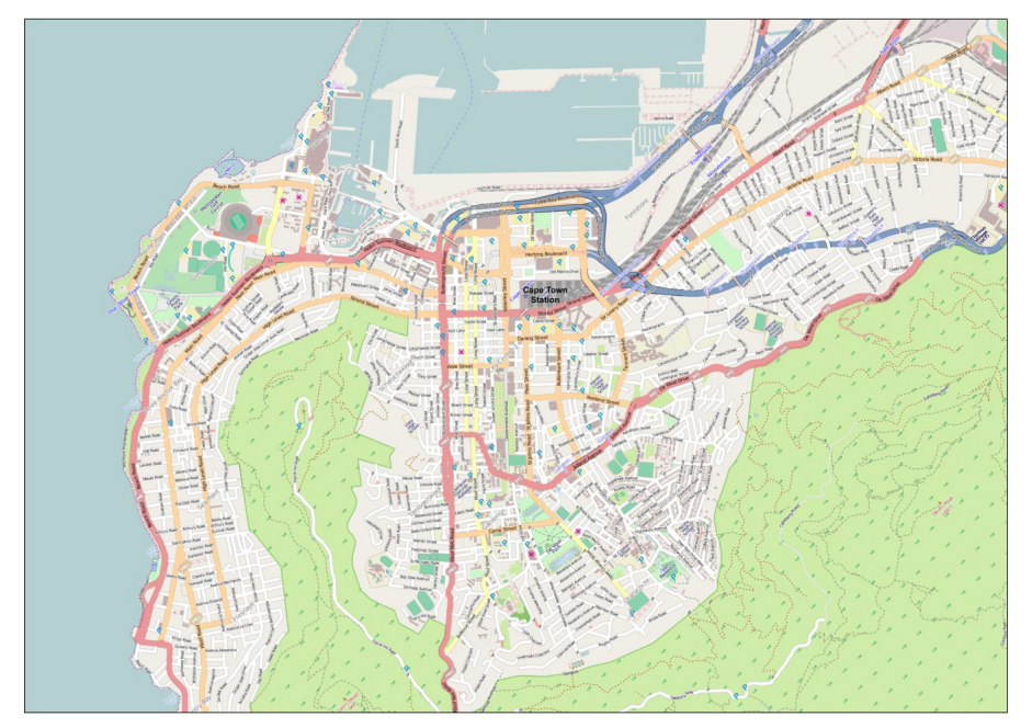
Figure 1: Cape Town's Central City.

Inclusive urban planning is at the heart of making the Central City Development Strategy a success. Exclusionary colonial and apartheid spatial planning is responsible for many of Cape Town's present challenges; developing a new way of planning must accordingly play a key role in shaping the city's integrated future. Since the launch of the CCDS in 2008, a series of new strategies and policies across the city have given rise to new planning possibilities, particularly in respect of the idea of sustainable densification. Documents such as the City of Cape