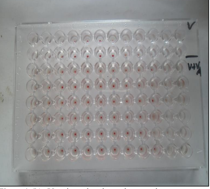
Figure1 (b): Vaccinated and supplemented