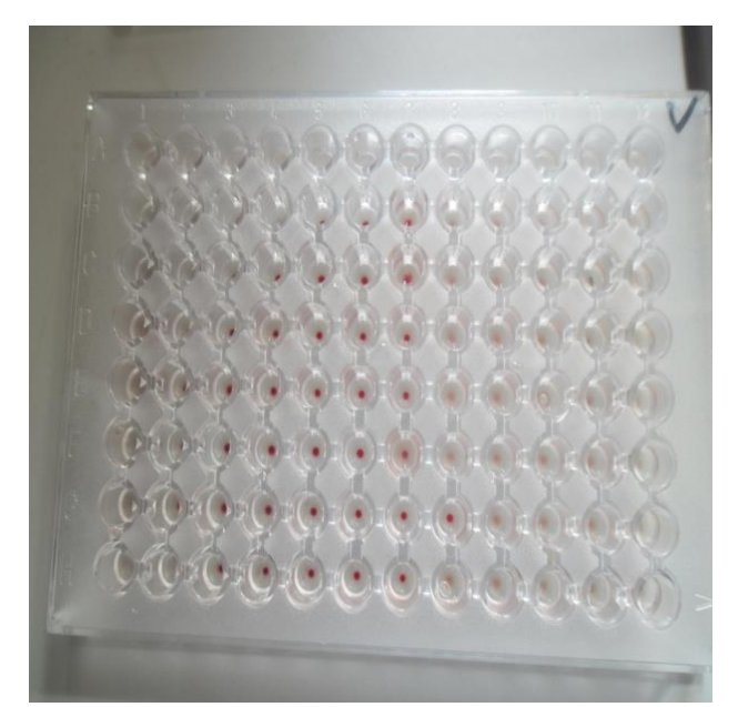
Figure 1 (a): Vaccinated only

The I-2 antibody titres in group I, II, III and IV were 2^{7.1} , 2^{9.1} , 2^{1.2} and 2^{1.1} , respectively. There were significant difference in antibody titres between chickens in group II and I.