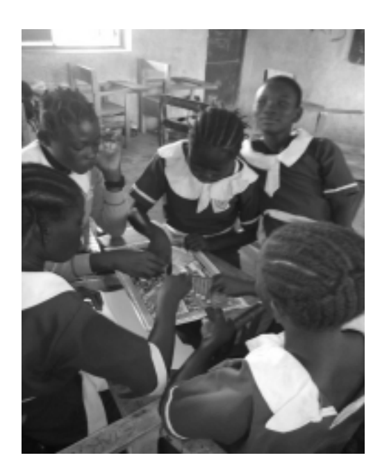
Plate 4. Some female students of Muslim High School, Isolu (Experimental Group) playing BLACOG.

The distribution of age among the students showed that most of the participants were aged 14-16 years (53.7%) while those aged 8-10 years (2.1%) were the least in number (Table 1). The most prevalent religious practice was Christianity with 173 (61.1%) adherents, Islam had 106 (37.5%) adherents while only 4 (1.4%) practiced traditional African religion (Table 1).