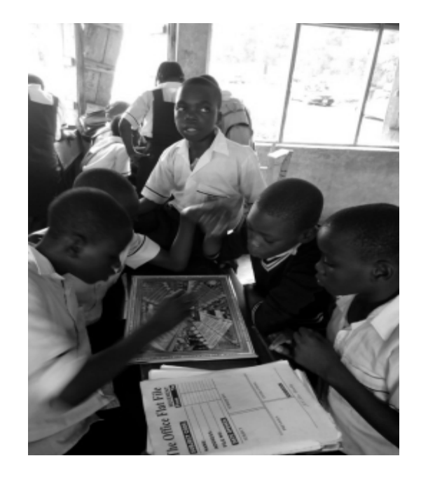
Plate 3. Students of Salawu Abiola Comprehensive High School, Osiele (an Experimental Group) playing BLACOG.