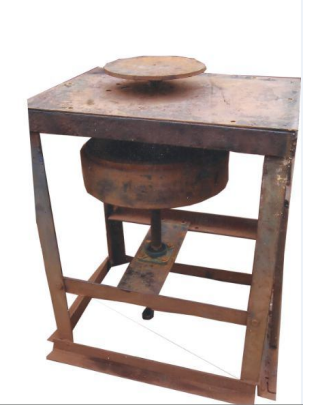
Figure 10. The Complete Kick Wheel

Step IV. The last stage of assembling is the coverage of the frame on top with metal pan and the screwing of the wheel head. But prior to the coverage, a hole which the shaft passed through is created on the centre of the pan with four small ones which the second industrial bearing is screwed on using bolts and nuts.