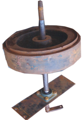
Figure 8. Assembled industrial bearings, shaft, fly wheel and connecting pan.

Assembling of one industrial bearing, shaft, and fly wheel and connecting pan.