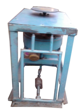
Figure 11. The Kick wheel after painting