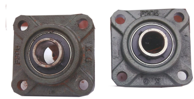
Figure 5. The two industrial bearings

To facilitate smooth spinning of the kick wheel, two 6204 industrial bearings are used. This makes it easy to rotate the flywheel which inturn rotates the wheel head easily even under a small kick thus reducing the exertion of much energy during throwing.