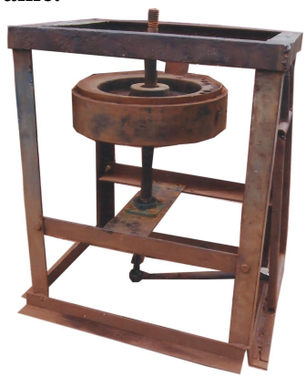
Figure 9. The fly wheel, shaft, industrial bearing and connecting rod fixed on the frame.

Step III. Having assembled the fly wheel, shaft, one industrial bearing and the connecting pan, two angle irons were screwed on the frame and it is on them that the U-shaped channel serving as cross bar caring the fly wheel and other parts that make-up that component is fixed using seventeen sized bolts, washers and nuts. To connect the shaft and the kick pedal together, peugout bore joint and its rod is screwed on the pan fixed on the bottom of the shaft which makes it easy to spin the fly wheel and the wheel-head when kicking.