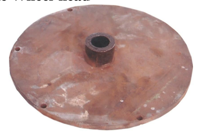
Figure 6. The Wheel head

The Wheel-head is made with 10mm thick mild steel metal pan. It measures 25cm in diameter. On the centre of the pan, a small round groove was created with lathe machine and thereafter a small threaded mild steel pipe measuring 3cm in height is driven into it while the outside is re-enforced through welding.