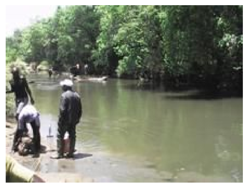
Figure 2 . Section of River Aswa with thick acotone zone in the background. Note the mainstream being detached from the floodplain and exposed bottom rocks in the background.

Other key field observations were the mandatory buffer zone of 100 metres for rivers, specified under the Sixth Schedule of the National Environment (Wetlands; River Banks and Lake Shores Management) Regulations 2000 that was intact. This condition was probably a result of the insecurity in the region over the past 25 years. There was no evidence of commercial fishing activities, except for subsistence fishing reported by residents. However, much of the area was covered by savannah woodlands, composed mainly of Combretum and Terminalia shrubs (Saundry and Fund, 2012).