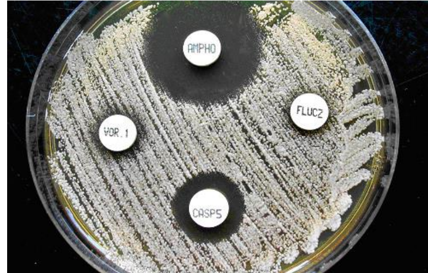
Fig 1: Disc Diffusion Method, Source: Rosco diagnostica, 2011

exhibited resistance while 92% were sensitive it. In the same vein, 4% of C. parapsilosis , 2% of C. albicans , 2% of C. glabrata , 2% of C. tropicalis , and 2% of C. haemulonii were resistant to Amphotericin B, but 88% proved sensitive to it. Susceptibility to Ketoconazole was observed to be as follows: 2% of C. albicans and 2% of C. haemulonii were found resistance while 96% were sensitive. The next antifungal agent, Itraconazole proved the most effective in vitro with all isolates (100%) sensitive to it. A sample of disc diffusion technique used is given in Fig. 1