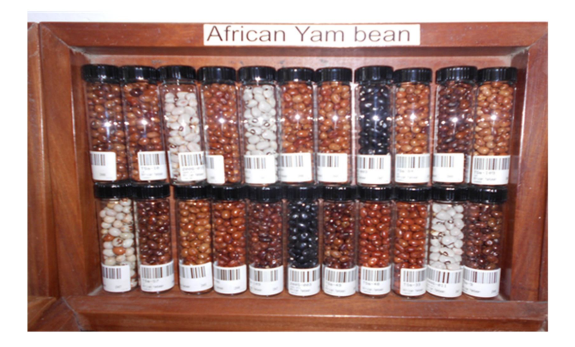
Plate 1: Genetic Diversity as exhibited by seed colours in African Yam Bean ( Sphenostylis stenocarpa ) held in IITA seed bank, Ibadan Nigeria.