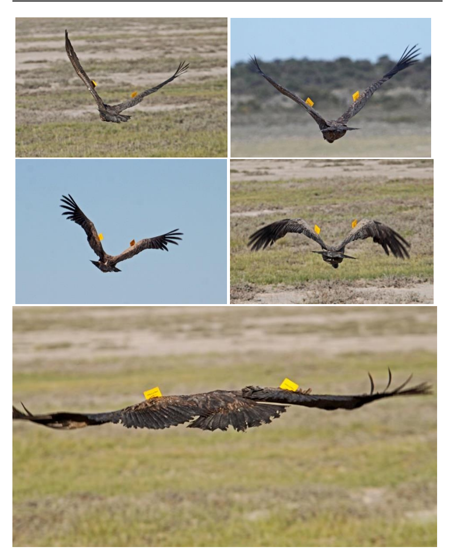
Figure 2. Illustration of cattle ear tags on White-backed Vultures ( Gyps africanus ) tagged in Botswana. Note how the tags lift off the wings in flight.