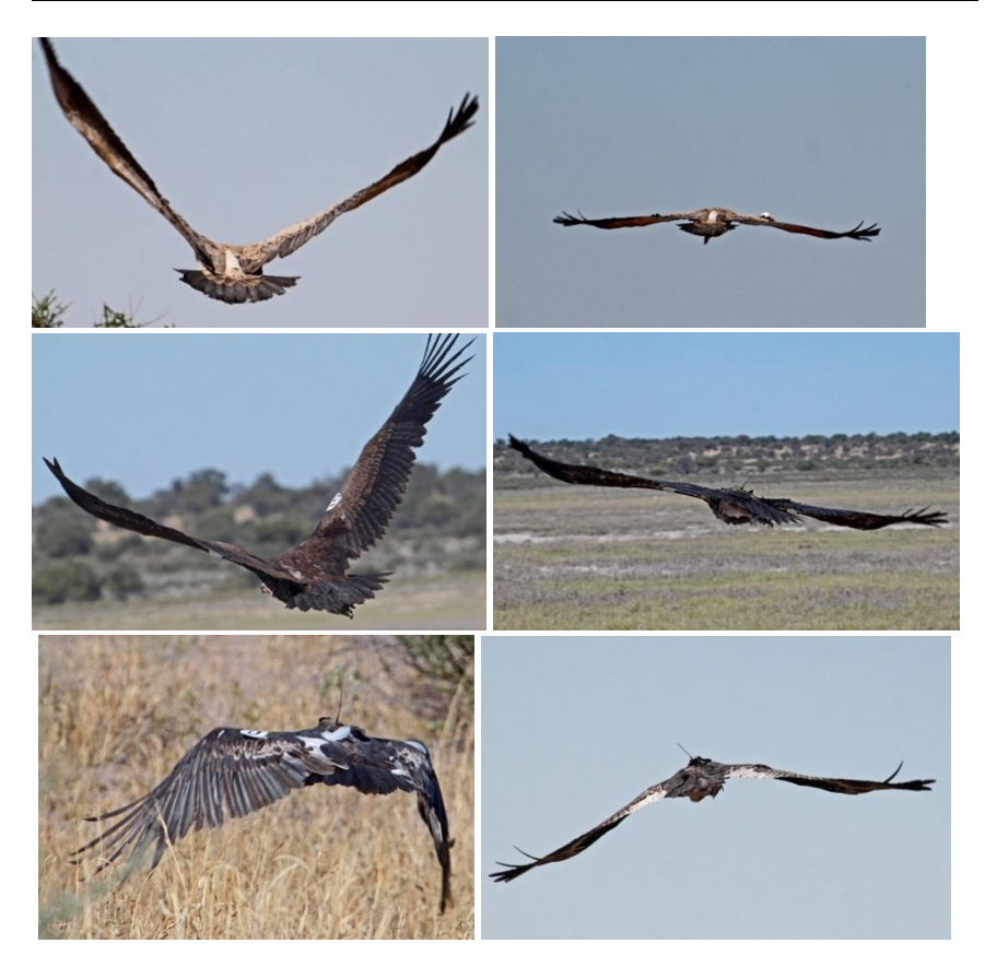
Figure 3 . Illustration of wing tags developed for California Condors ( Gymnogyps californianus ) on White-backed Vultures ( Gyps africanus ) (top), Lappet-faced Vultures ( Torgos tracheliotos ) (middle), and White-headed Vultures ( Trigonoceps occipitalis ) (bottom) tagged in Botswana. Note how the tags lie flat on the wings in flight.