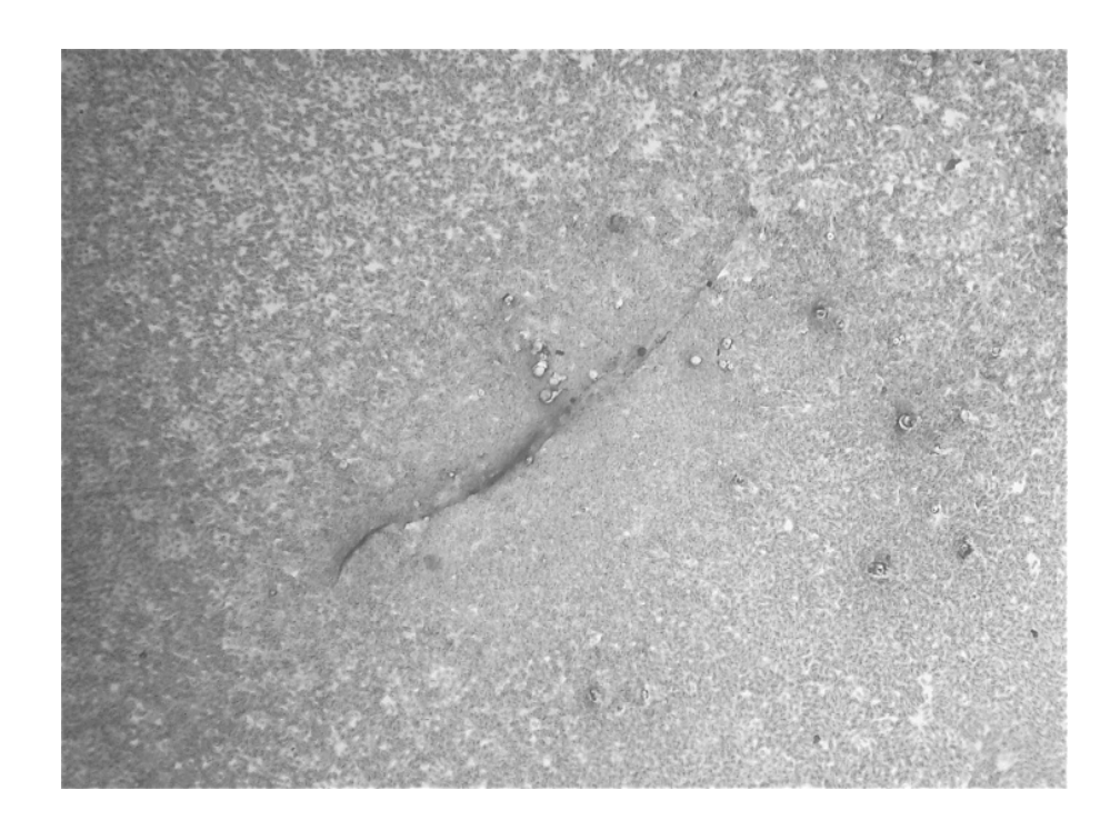
Figure 2: Microfilarium in Black Vulture blood smear.