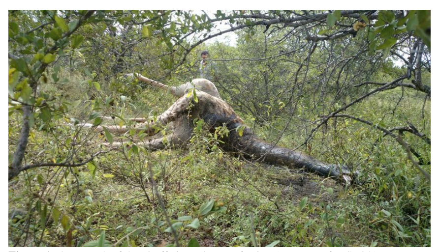
Figure 1 Photograph of the giraffe in early putrefaction.

showing the location of the five strikes (Figure 3).