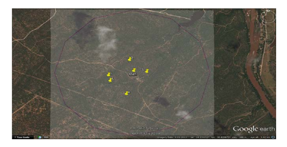
Figure 3: Lightning data of alleged strike overlaid on Google Earth.

The carcass initially showed blackening of the head and neck; no other external injuries to the body could be identified. An unusual 'ammonia-like' smell was present around the carcass. Poisoning as a cause of death could provisionally be excluded, due to the fact that no other poisoned animals were present in the region and there were no signs of vomiting or diarrhoea. However no toxicological analysis was performed. It seemed as though the giraffe had died instantaneously as there were no visible signs of a struggle in the area immediately surrounding the carcass.