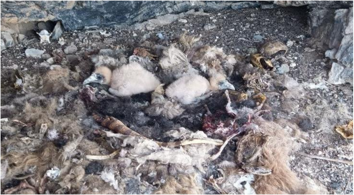
Figure 2: Two Egyptian Vulture chicks, 5-7 and 9-11 days old, Arystantau, 30.05.2021.