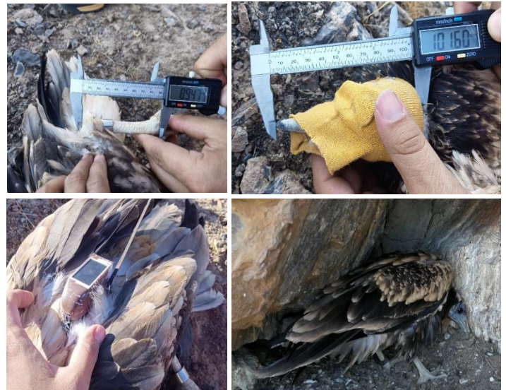
Figure 3: Measuring of juvenile Egyptian Vultures (top row), installing the transmitter on a vulture chick 65 days old (bottom left), tagged bird in nest (bottom right).

transmissions when the battery was low and increasing when the battery levels were high due to good exposure to the sun.