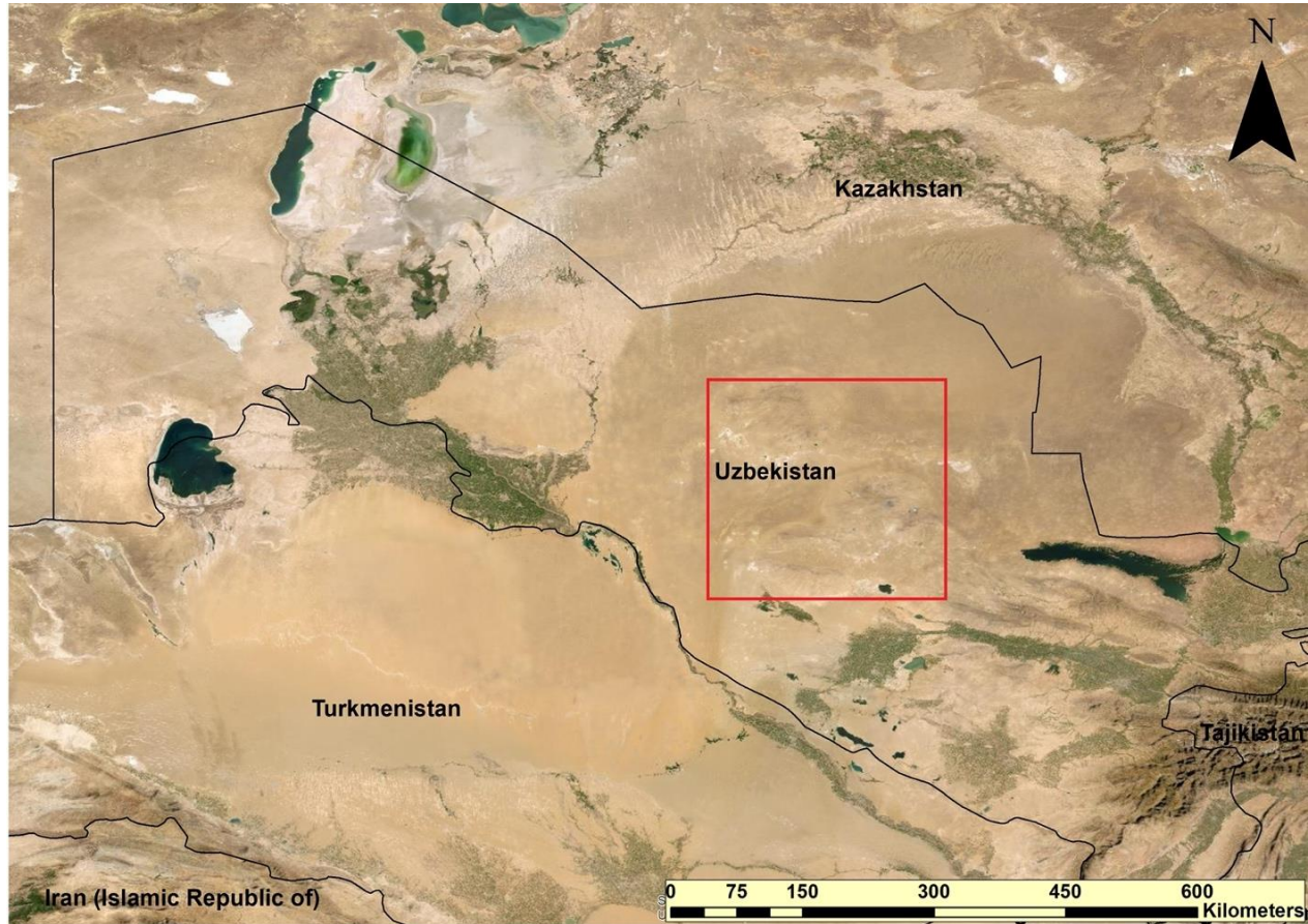
Figure 1: Study area (red square) in the center of the Kyzylkum Desert, Uzbekistan, containing known Egyptian Vulture nesting sites.

Muruntau, Bukantau and Ayakagitma (Central Kyzylkum). Seven of the nests were successful and we recorded nine juveniles, whereas three other nests were found empty and they had either failed or the chicks had fledged at least a week prior to our arrival.