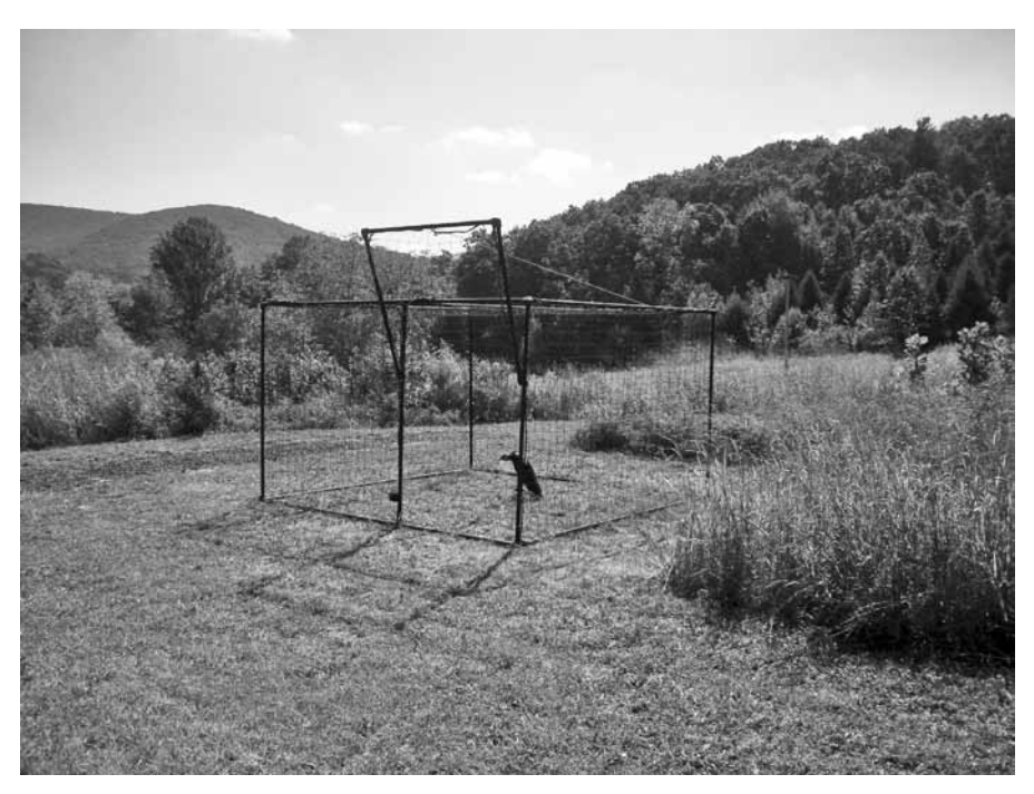
Figure 1. Portable, lightweight, walk-in trap with door open and taxidermy mounted Turkey Vulture ( Cathartes aura ) for scale.

soccer (i.e. football) netting was purchased from Seattle Marine & Fishing Supply Co. (Seattle, Washington, USA) for the cost of $8.99/m (15 m are needed). The total cost of the trap was approximately $US 540 in 2010.