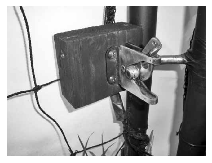
Figure 3. Close-up of gate latch.