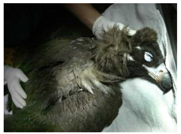
Figure 10: Rescued injured Cinereous Vulture