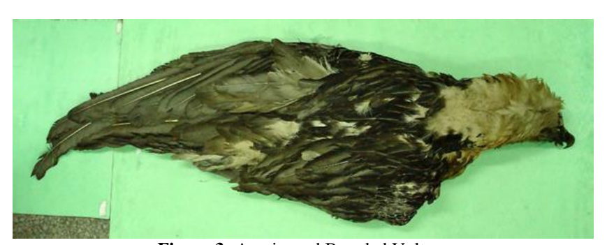
Figure 3: A poisoned Bearded Vulture

deliberately poisoned carcasses, and vultures become the unintended victims (Figure 3). In such cases, one poisoned carcass can kill a large number of vultures. At one sky burial site, we were told by local people that about 100 vultures were found dead after feeding on a human carcass (Jin and Yu 2004). This matter caused quite a shock among the local community, and as a result, sky burials were not permitted for people who died of toxicosis or infectious diseases, in an attempt to prevent poisoning of vultures.