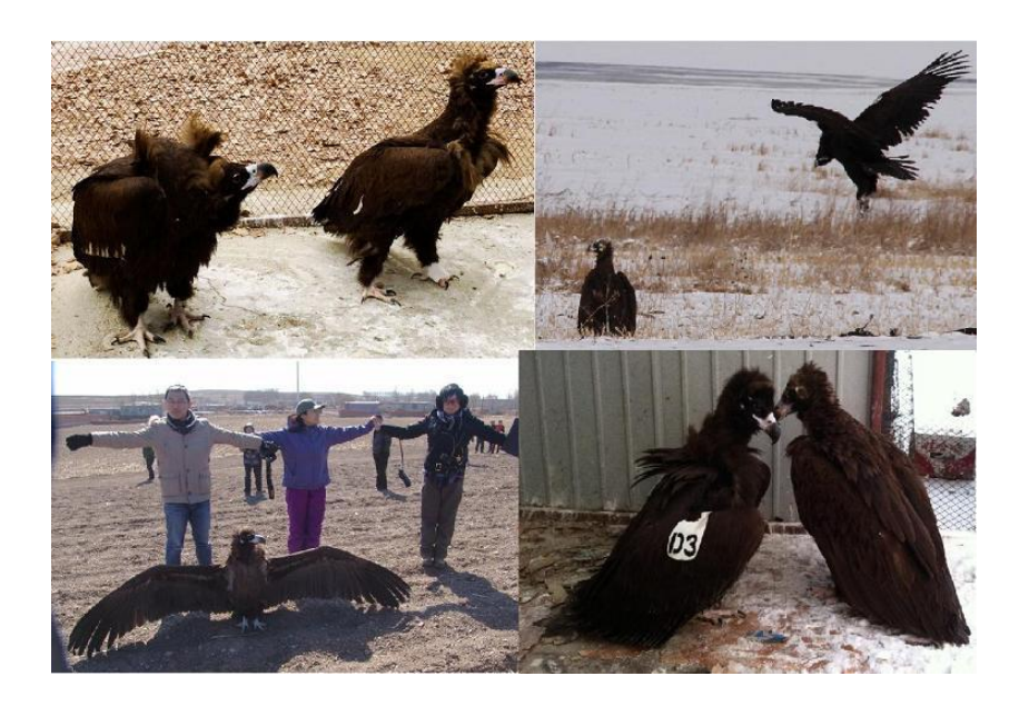
Figure 7: These Cinereous Vultures were caught for sport or entertainment

fate of these birds is unknown, but it is clear they were captured from the wild as there is no breeding of this species in zoos. Further, due to inadequate management, it is likely that these birds will be dead before too long, thus requiring that more wild birds are captured. As a result, capturing vultures from the wild is unlikely to end, which will continue to have a detrimental impact on wild populations.