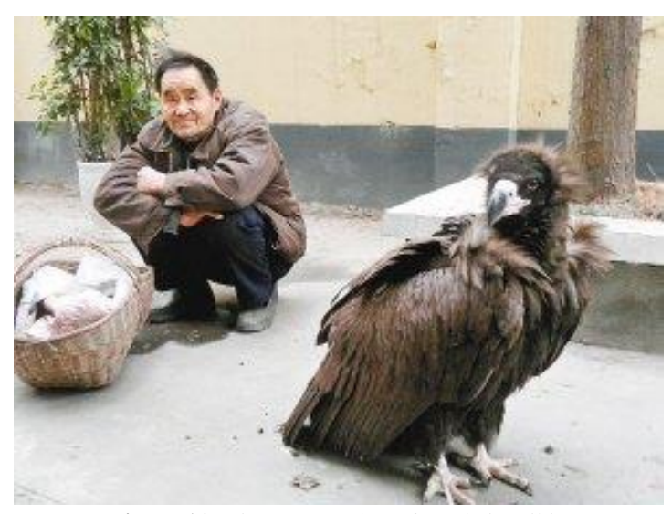
Figure 11: Cinereous Vulture for sale in Yibin