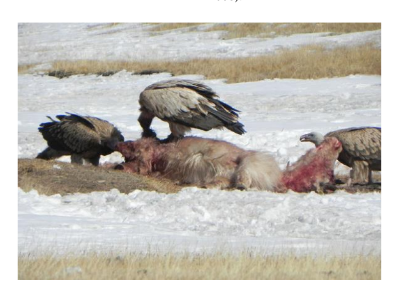
Figure 6: Himalayan Griffons eating a dead yak

Between August-October 2012 and March-October 2013, we spent more than 90 days in the field in central Tien Shan, and we found some chicks still in the nest in September and October. This is a unusual phenomenon. speculate that the food shortages is a reason why they are still in the nest (Ma et al. 2013, Liu et al. 2013, Clements et al. 2013). At the same time, in the western region, we found some vultures breeding earlier than normal, which may be a strategy response to climate change, different land-use practices and food changes (Houston 1990, Murn and Anderson 2008).