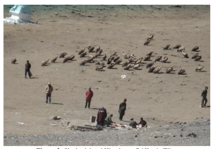
Figure 2: Sky burial and Himalayan Griffon in Tibet

sky burial sites are distributed over the Tibetan plateau. Local Buddhist people believe that the vultures take the soul of the dead person to heaven. Because of this, local people value and protect vultures.