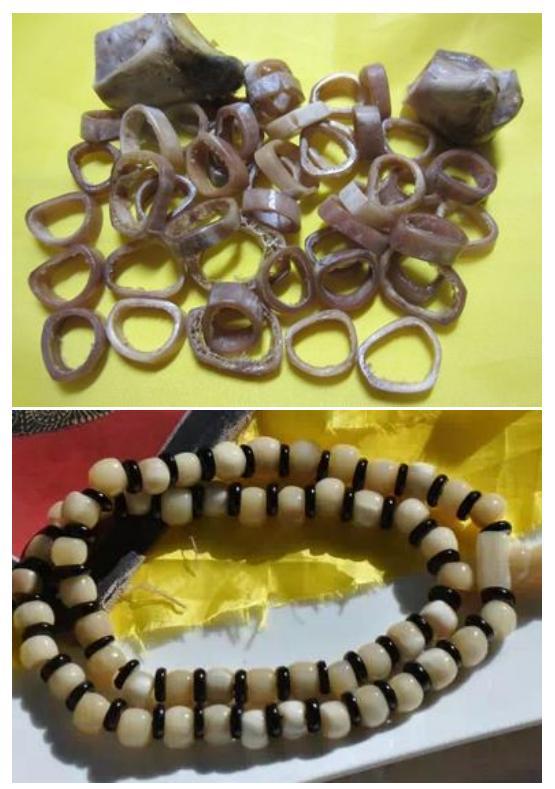
Figure 9: The bones from a Cinereous Vulture for sale in a shop