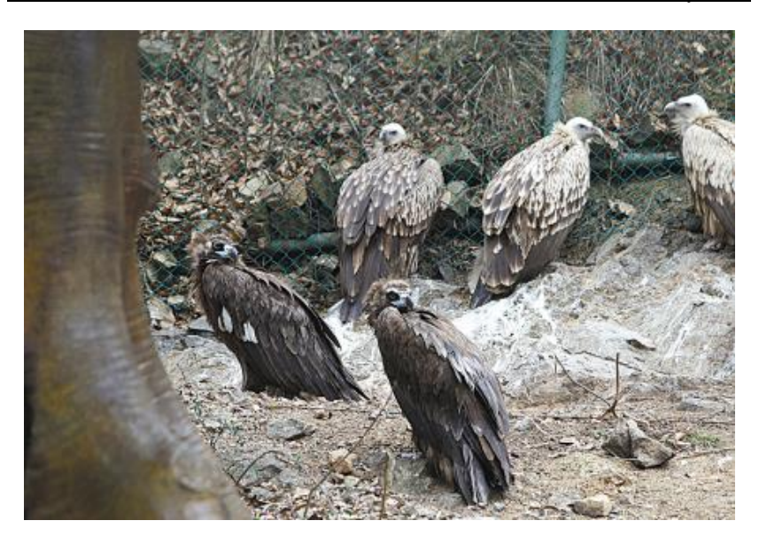
Figure 8: Himalayan Griffons and Cinereous Vultures in Ningbo Zoo