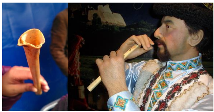
Figure 5: The specimen and vulture bone flute in China

contributes to demand. In addition, the Tibetan and Tajik people make flutes with vulture bones to play music (Figure 5), which is part of their traditional culture (MaMing et al. 2014). Flutes made from vulture wing bones are very expensive; prices in Xinjiang can exceed 10,000 Yuan [~$1,700 US], which undoubtedly stimulates harvesting of vultures from the wild.