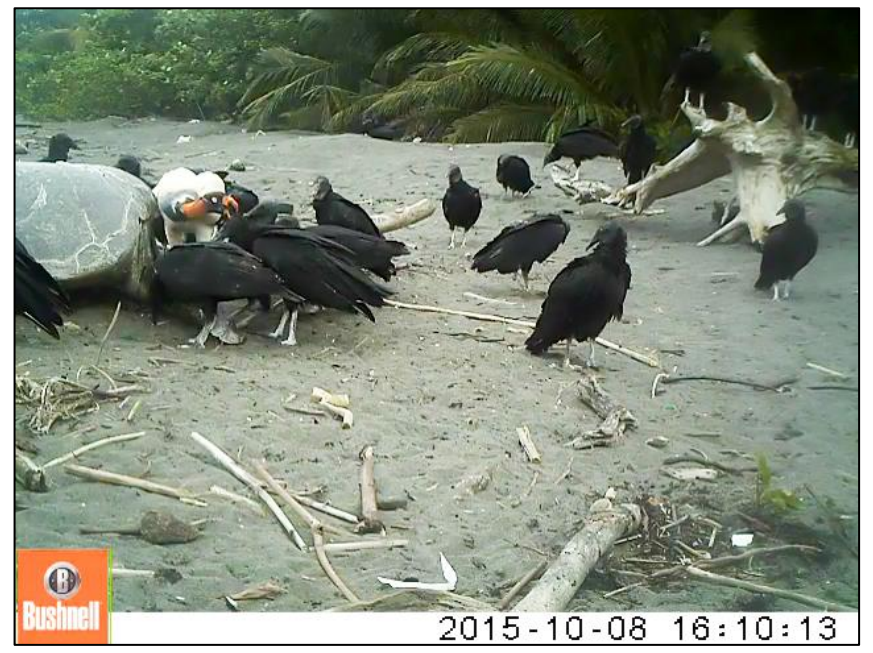
Figure 2. An adult King Vulture ( Sarcoramphus papa ) establishing dominance over American Black Vultures ( Coragyps atratus ) at the carcass of a depredated green turtle ( Chelonia mydas ), Tortuguero National Park, Costa Rica.

the 14<sup>th</sup>. On the third day (October 13<sup>th</sup>) an adult King Vulture was recorded from 07:48 h to 08:48 h. During this event we recorded the King Vulture feeding from various