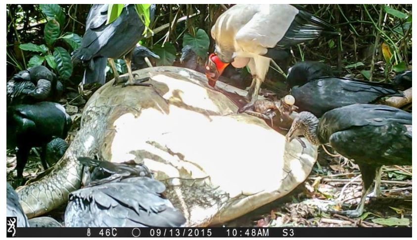
Figure 3. An adult King Vulture ( Sarcoramphus papa ), with a distended crop, feeding from a green turtle ( Chelonia mydas ) carcass, Tortuguero National Park, Costa Rica.

documentation of King Vultures scavenging from green turtle carcasses. Since so little is known regarding King Vultures, our data