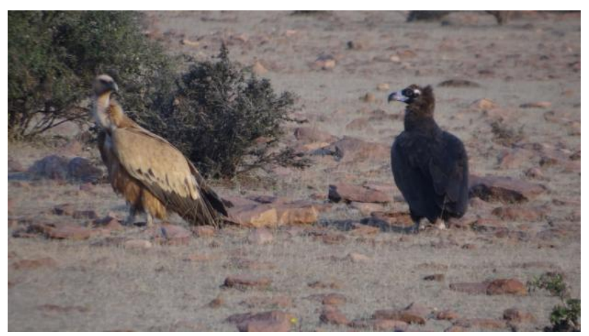
Figure 1: Griffon Gyps fulvus and Cinereous Vulture Aegypius monachus in Mukandara Hills Tiger Reserve.