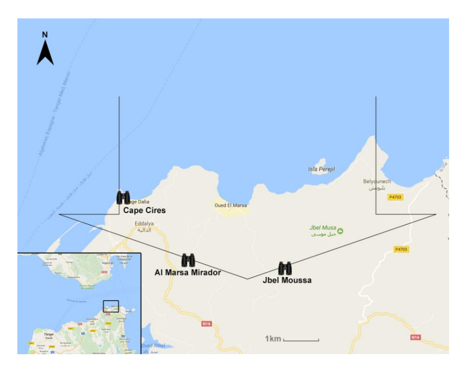
Figure 1: Map of the study area in North Morocco, located on the southern shore of the Strait of Gibraltar. The three lookouts are marked and the coast section that comprises the entrance of the vultures is limited with an arrow.

most birds arriving between Alhamiar and Almarsa capes, all in the Tanger province (Figure 1). This stretch of coastline involves the northernmost tip of Morocco and the shortest sea crossing between Africa and Europe.