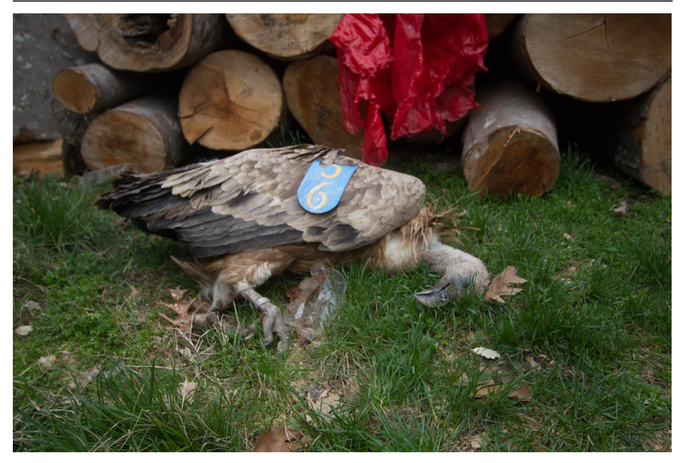
Figure 3: Vulture 56 in the yards of the Pirin Park rangers. Kresna Gorge, Bulgaria.