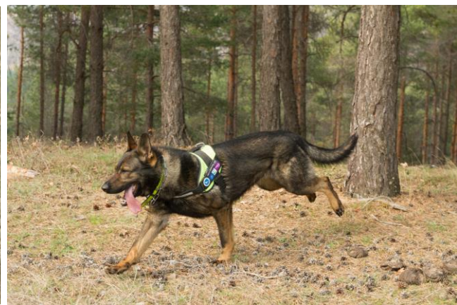
Figure 6: The BSBP Anti-Poison Dog Unit in action.