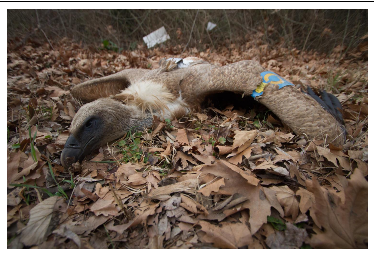
Figure 4: Vulture 9