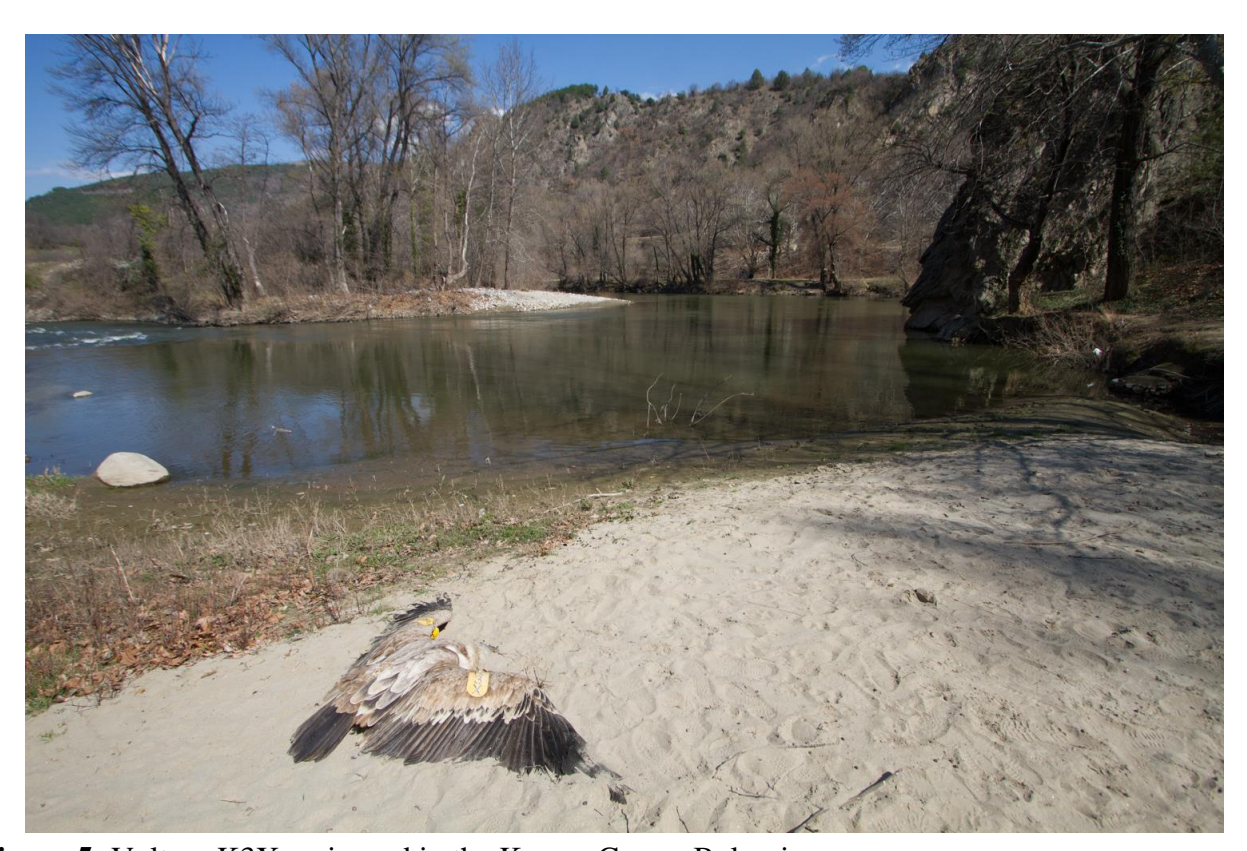
Figure 5: Vulture K3X, poisoned in the Kresna Gorge, Bulgaria