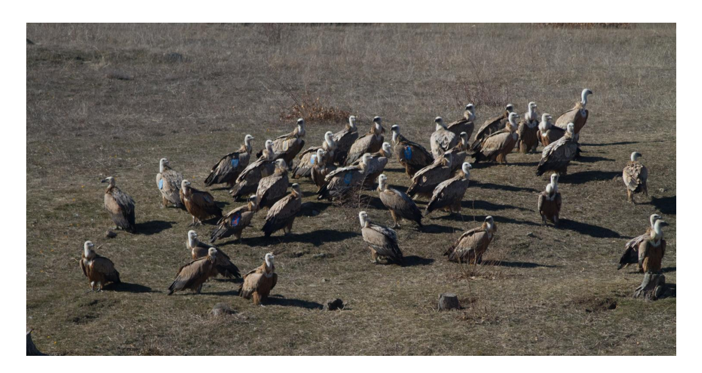
Figure 2: Vultures near the feeding site in the Kresna Gorge, Bulgaria, January 2017.

number of birds was showing breeding behaviour was identified, with 10 pairs in two distinct colonies, or breeding sites.