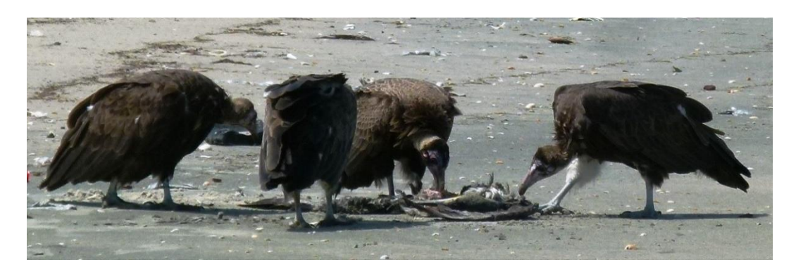
Figure 4: Hooded Vultures feeding on a Great Cormorant Phalacrocorax carbo carcass close to a dolphin stranding event which had attracted 33 Hooded Vultures, Tanji Bird Reserve beach, 20 July 2018 (Photo: CRB).