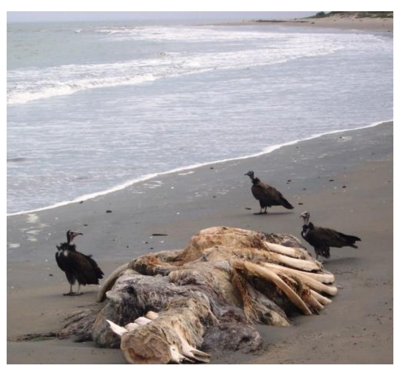
Figure 2: Humpback Whale Megaptera novaeangliae washed up intact and first reported on 10 June 2014, with Hooded Vultures still visiting to feed on remains, 24 Aug 2014, Bantakunku Point beach.