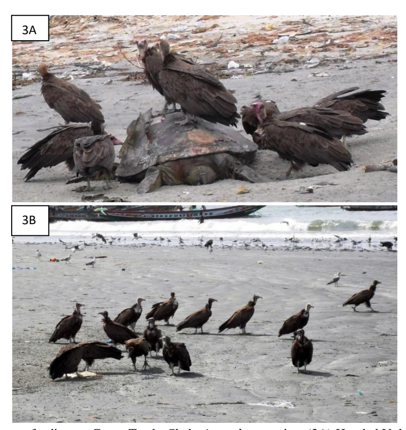
Figure 3: Hooded Vultures feeding on Green Turtle Chelonia mydas remains: (3A) Hooded Vultures waiting for a large turtle carcass to be opened up to access soft tissue, Tanji Bird Reserve beach, 14 Oct 2012 (Photo: CRB); (3B) the carapaces from small Green Turtles caught and discarded as fishing bycatch attract a group of Hooded Vultures at Tanji fish landing site, 17 Nov 2014 (Photo: CRB).