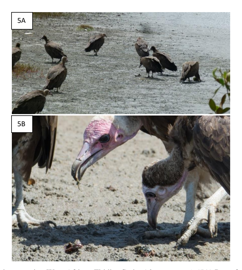
Figure 5: Hooded Vultures eating West African Fiddler Crabs Afruca tangeri : (5A) Part of a group of 18 Hooded Vultures watching, chasing and probing for crabs at low tide at Tanji Bird Reserve, 10 June 2018 (Photo: CRB); (5B) dismembering and eating crabs on Old Cape beach, Bakau, 7 May 2015 (Photo: Dave Montrieul).