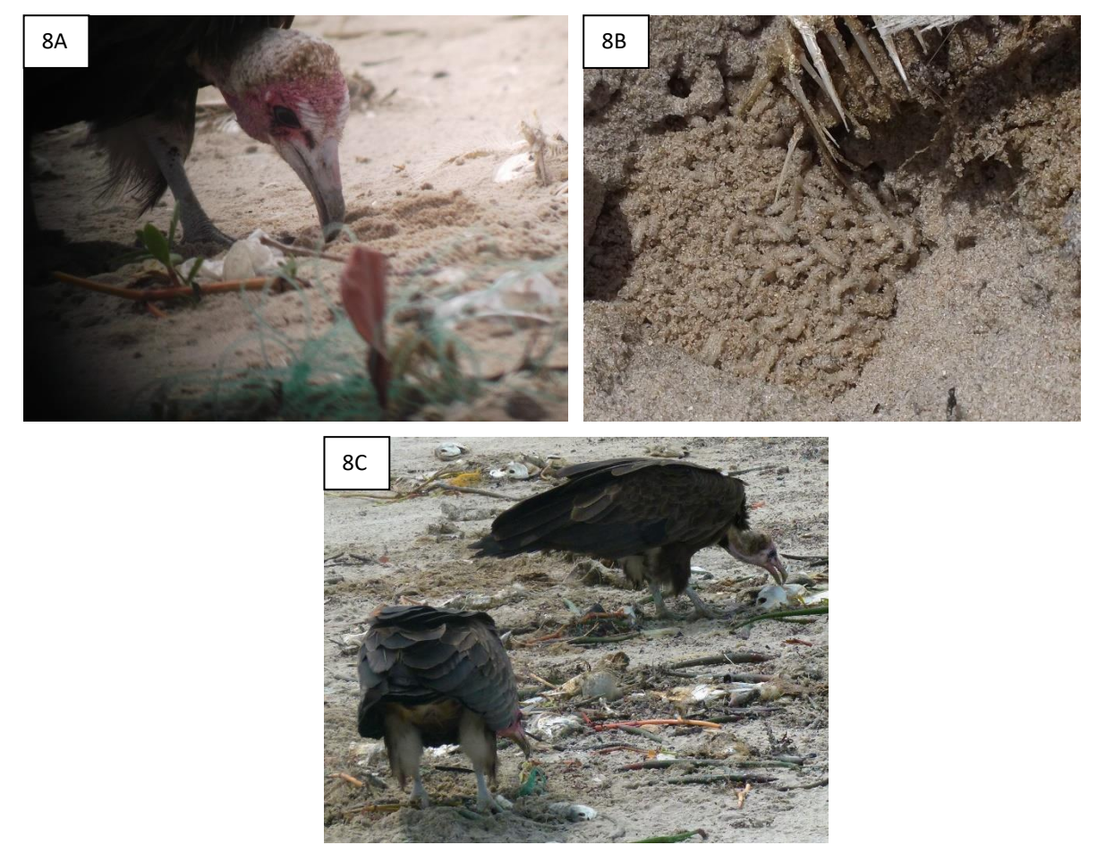
Figure 8: (8A) A Hooded Vulture probing for maggots (fly or other invertebrate larvae) in a ghost crab Ocypode sp. burrow at Tanji Bird Reserve beach, 13 Sept 2014; (8B) maggots from the same burrow excavated by CRB; (8C) Hooded Vultures search for maggots on washed-up fish at Tanji fish landing site, 4 Sept 2015 (Photos: CRB).