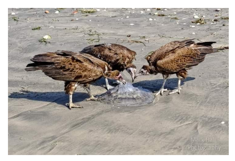
Figure 7: Three juvenile Hooded Vultures investigate a jellyfish (possibly Rhizostoma luteum , K. Lewis pers. comm.) at Kotu beach, 20 March 2017.