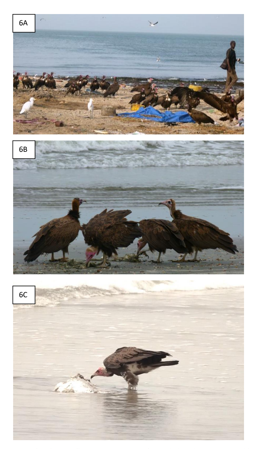
Figure 6: Hooded Vultures feeding on fish: (6A) a group of Hooded Vultures approaching discarded herring being dried for animal feed at Tanji fish landing area, 10 Dec 2017 (Photo: CRB); (6B) Hooded Vultures feeding on a puffer fish Tetraodon sp. on Brusubi Heights beach, well away from a bustling landing site, 9 Oct 2015 (Photo: CRB); (6C) Hooded Vulture wading in the shallows to feed on a large fish at Kotu beach, 16 July 2019 (Photo: GD).