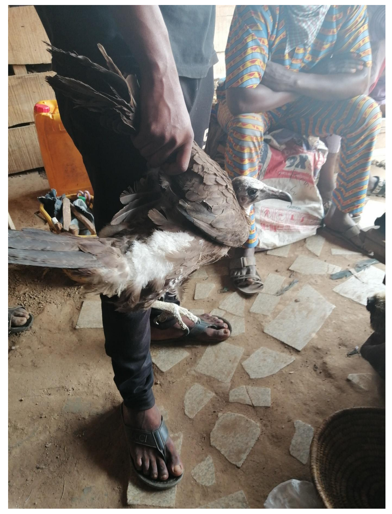
Figure 1: A man holding a captured Hooded Vulture for sale in a wildlife market in Ibadan, Nigeria, ca . March 2020.