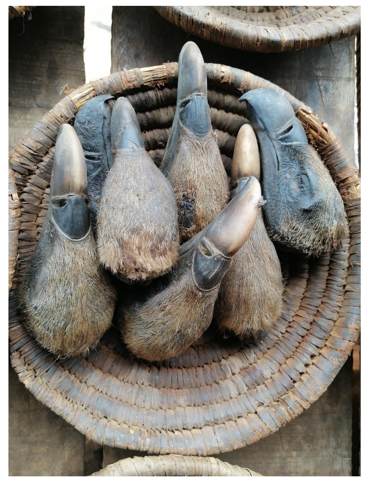
Figure 2: Rüppell's and White-backed Vulture heads for sale at a wildlife market in Ibadan, Nigeria, ca. March 2020.