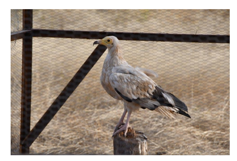
Figure 1: Photograph of the Egyptian Vulture (named "Sa'a") in its newly built aviary in Kellé, Niger.

Sa'a's story illustrates the consequences of poaching, even for rescued individuals, and the importance to fight these threats to conserve this species as well as other vultures. Despite this disappointing outcome, having Sa'a at SaharaConservation's facility has been helping to raise awareness as its presence draws attention and the background story makes a strong impression with visitors. For example, several environment officers have had the opportunity to observe an adult Egyptian Vulture for the first time and members of the local community have been trained in caring for injured vultures. To our knowledge, such a rescue has never happened in the region before, and SaharaConservation thanks the BSPB, Green Balkans and the Saint Louis Zoo for their support.