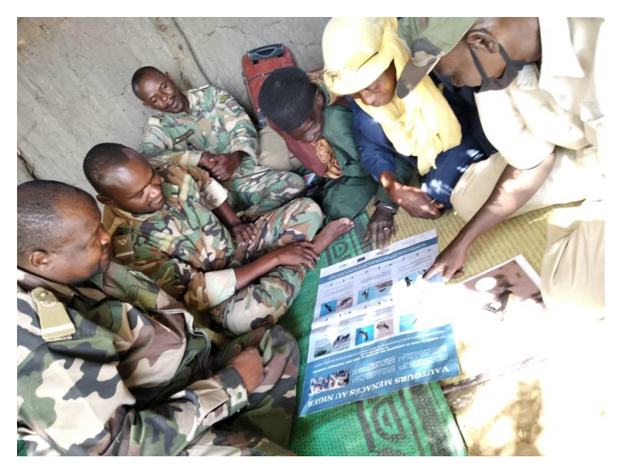
Figure 6: Capacity building of environmental officers in the region of Zinder in November 2021.