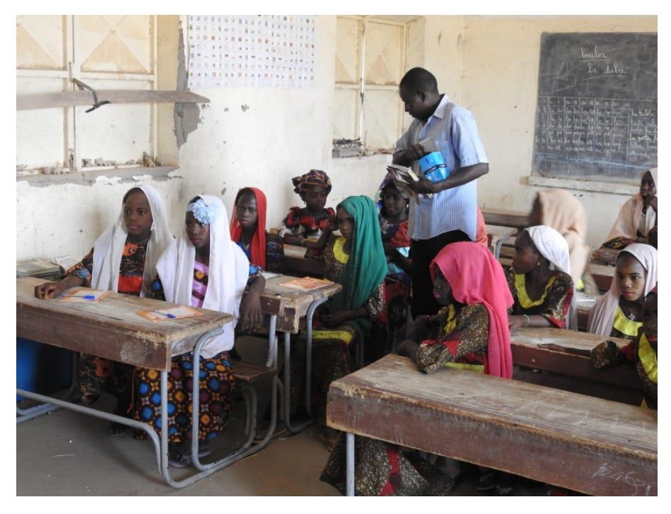
Figure 8 : Distribution of educational material in a primary school in Koutous massif (Ganatcha) in May 2022.