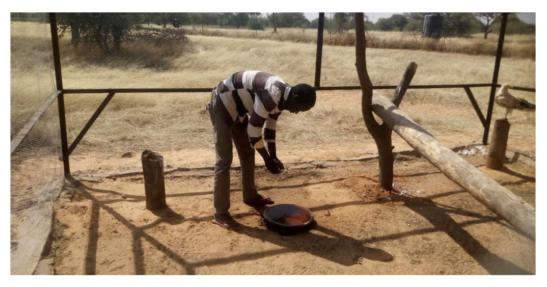
Figure 3: One of SaharaConservation's team in Kellé cleaning, feeding and watering Egyptian Vulture, Sa'a.