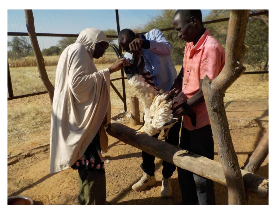
Figure 2: SaharaConservation team members checking Egyptian Vulture Sa'a's feathers.