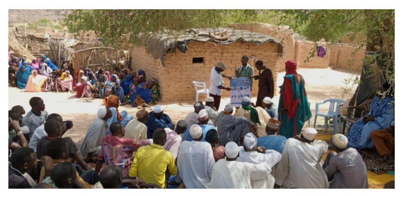
Figure 4: Awareness raising among local communities, in the Koutous Massif in May 2022.

Concurrently, environmental officers posted close to vulture breeding populations were also trained in vulture identification and on the threats that they are facing, to improve their capacity in fighting illegal hunting. Similarly, the management unit of the Gadabeji Biosphere Reserve, where Rüppell's and White-headed Vultures are nesting, are supported during monthly monitoring surveys of the nests within the reserve (Figure 7).