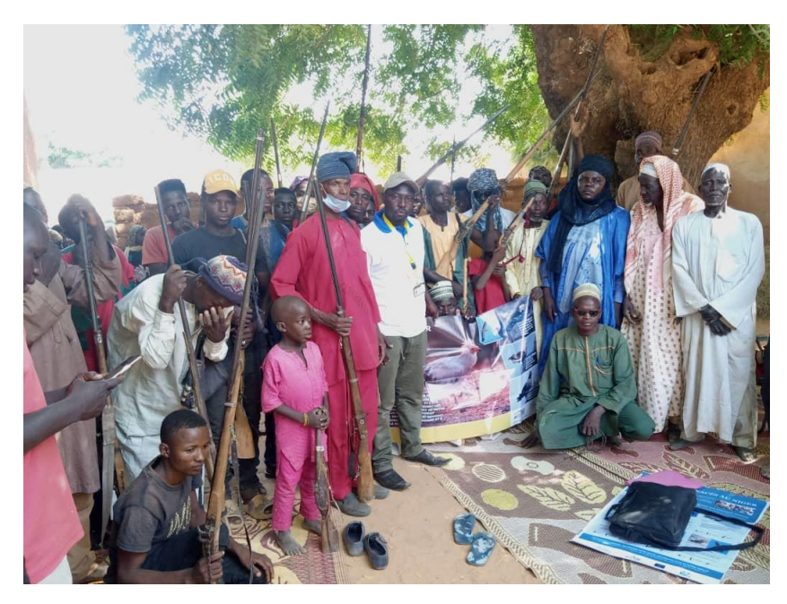
Figure 5: Sensitization of hunters and traditional practitioners in the region of Zinder, November 2021.