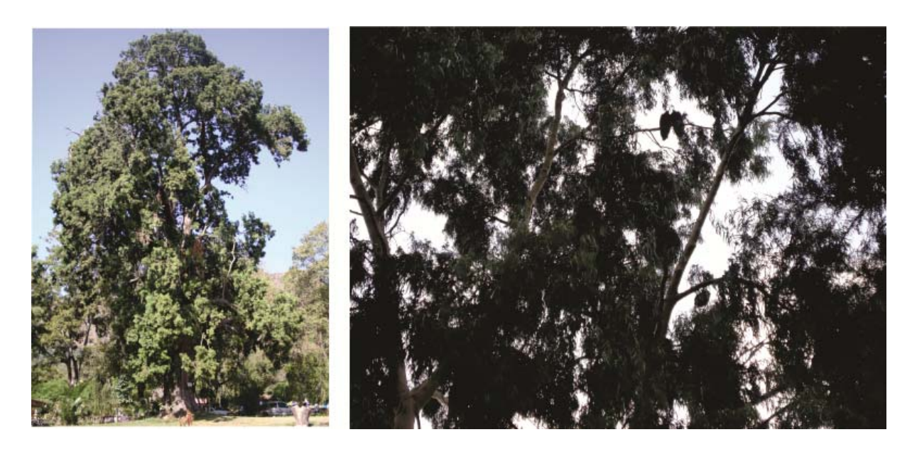
Figure 2: Important roost trees AWBV and HV. Podocarpus falcatus (R-7) and Eucalyptus sp. (R-1) in WGCF-NR, Southern Ethiopia, January -March 2012