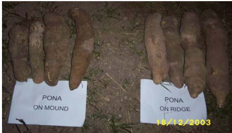
Fig. 2. Effect of seedbed preparation on tuber shape of 'Pona' yam varieties.