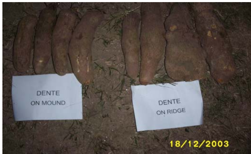
Fig. 3. Effect of seedbed preparation on tuber shape of 'Dente' yam variety.

Ease of management. Generally, the farmers considered manual ridging as more labour intensive than manual mounding for yam production. This is in contrast to the response obtained from construction of seed beds for cassava production where ridging was found to be easier than mounding (Table 4), possibly due to the smaller sizes (30–34 cm high) of the cassava seed beds compared to yam (35–40 cm high). In instances where there are stumps, as is usually the case in yam fields in West Africa, where most farmers shift annually to clear fallowed fields in search of high fertility and stakes, mounding is the farmers' practice. Also, additional labour is required in the building of continuous ridges, which, when compared with mounds, necessitate the moving of substantially greater quantities of earth for yam production (Orkwor & Asadu 1998). However, in view of the pressure on land and the unsustainability of annual shifting cultivation for yam production, absence of stumps will become a feature of modern yam production on old fields with fertilizer application. In the absence of stumps, ridging, unlike mounding, lends itself easily to mechanization (Kumwenda, 1999), and removes the drudgery associated with seed bed preparation and increase the scale of root crop production when mechanized.