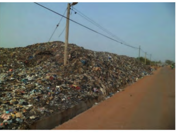
Fig. 2 Uncollected waste spilling into homes and streets at various transfer stations in the municipality.