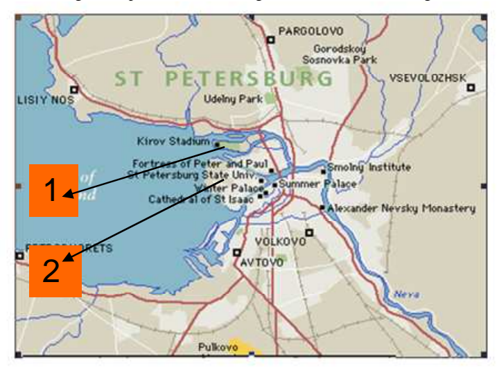
Fig 2. Map of St. Petersburg showing the two study areas of Vasileostrovsky and Elagin Ostrov

The methodology involved an evaluation of literature on selected bioindicators, reviewed of data from previous researchers on physical and chemical characteristics of various components of the urban environ-ment, which forms the baseline information for the study. The field work involved examining the characteristics of natural and anthropogenic factors that are likely to influence the character of urban environment and research results. These included visual assessment of selected study sites to determine the nature of land use, relief, drainage characteristics and vegetative cover. Information on the above was used to specify sampling sites.