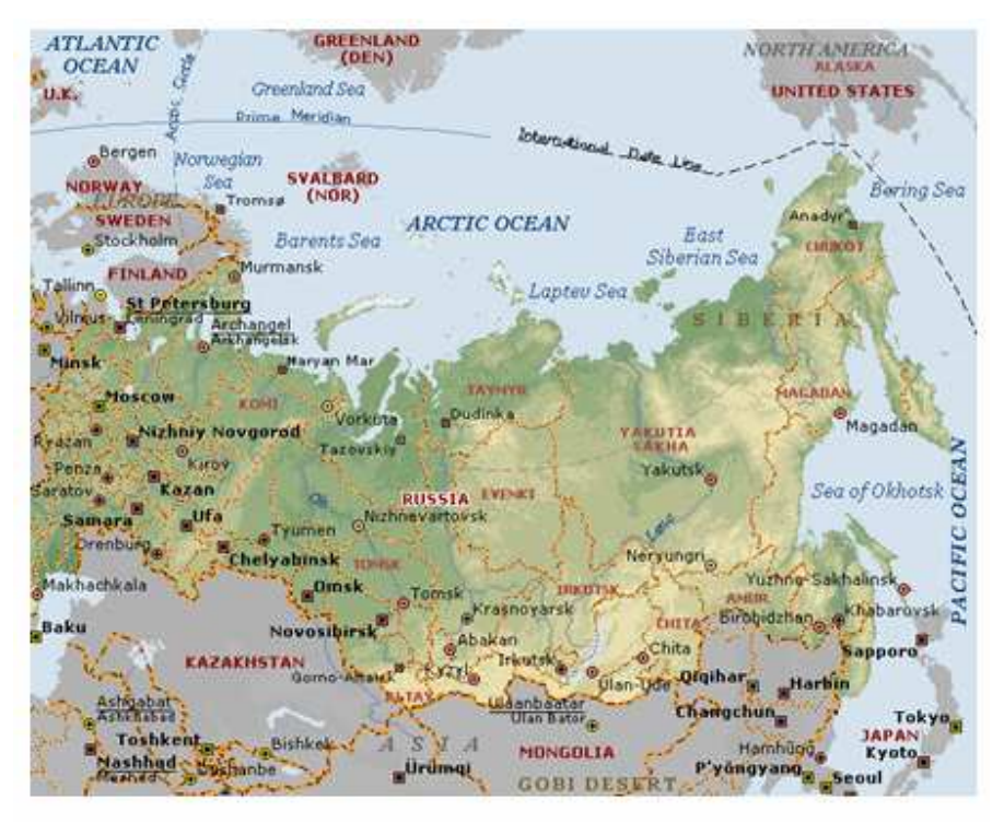
Fig. 1. Map of Russia Showing location of St. Petersburg