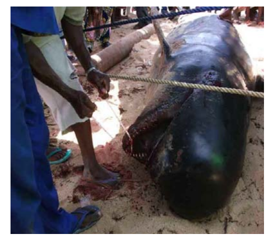
Fig. 3. Short-finned pilot whale, Globicephala macrorhynchus landed at Ekpè in 2011, to be sold as marine bushmeat.

Short-finned pilot whale Globicephala macrorhynchus Gray, 1846. One short-finned pilot whale was landed by artisanal fishermen at Ekpè (06°21.9306' N,