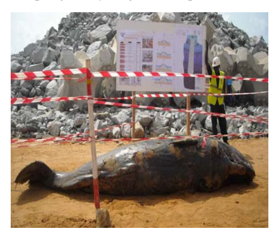
Fig. 7. Neonate/foetus of sperm whale, Physeter macrocephalus found stranded near Cotonou port

Sperm whale Physeter macrocephalus Linnaeus, 1758. On 19 April 2010 the MNT museum was alerted by the Service Environnement du Port Autonome de Cotonou that a small sperm whale had stranded on a beach within the port's security zone. One of the authors (JDB) and agents of the Direction Générale des Forêts et Ressources Naturelles from Ministère de l'Environnement et de la Protection de la Nature documented the event (Fig. 7). The carcass was buried in situ without biological sampling. Body length was reported as 367