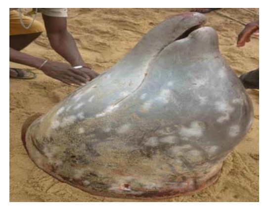
Fig. 5. Severed head of a young male Cuvier's beaked whale, Ziphius cavirostris , at Togbin in 2011 (see text).

Cuvier's beaked whale , Ziphius cavirostris Cuvier , 1823 . In the morning (09:00 h) of 14 August 2011, locals of Fidjrossè, Togbin (06°27.635', N 002°23.492' E), Département du Littoral, witnessed three small whales swimming close to shore. Fishermen returning from nocturnal fishing operations alerted associates onshore and jointly managed to drive one animal into shallow water. By attaching a rope around the tailstock the shore-based crew, aided by onlookers, pulled the ca. 4 m long whale towards the beach (Fig. 5). The male