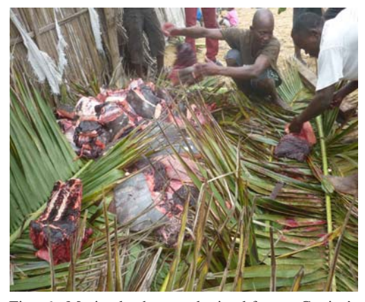
Fig. 6. Marine bushmeat obtained from a Cuvier's beaked whale at Togbin, gathered at one site before equitable distribution among locals.

Cuvier's beaked whale was swiftly exsanguinated, decapitated and sectioned in chunks with machetes and knives. Fishermen and locals shared the meat (Fig. 6). None seemed aware or concerned of the protected status of cetaceans, although the local press raised the issue (Fraternité, 2011).