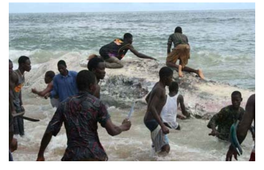
Fig. 8. Humpback whale, Megaptera novaeangliae stranded on Sèmè Kraké beach, in 2009, causes a frenzy among local youths despite the carcass' advanced state of decomposition.

Three boat-based surveys to evaluate the feasibility of whale-watching tourism in Benin, in October 2000, September 2001 and October 2002, recorded, respectively, 40, 26 and 42 humpback whales (Sohou et al. , 2001; Van Waerebeek et al. , 2000, 2001a,b; Van Waerebeek, 2007; Tchibozo & Van Waerebeek, 2007). This species is seasonally present off Benin and Togo from early August till mid-November (occasionally early December), indicating a wintering ground of a Southern Hemisphere population, earlier referred to as the Bight of Benin substock (Van Waerebeek, 2003; Van Waerebeek et al. , 2001a,b).