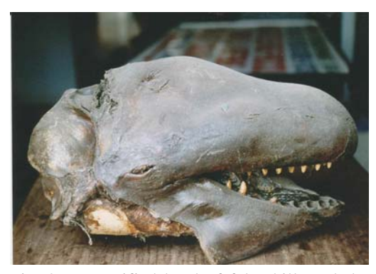
Fig. 2. Mummified head of false killer whale, Pseudorca crassidens , at the Fisheries Directorate in Cotonou.

Pêche, Cotonou, holds the mummified head of an adult false killer whale Pseudorca crassidens (Fig. 2) (Van Waerebeek et al., 2001a, 2009; Tchibozo & Van Waerebeek, 2007). Tooth counts are UL8, UR8, LL10, LR10. The teeth, circular in cross-section, allow a positive differentiation from the killer whale Orcinus orca, which has oval teeth. Although circumstances were unclear, the conservator confirmed that without exception all collection specimens originated from Benin, therefore, this P. crassidens represents the country's first record. Documented cases in West Africa remain scarce (Jefferson et al., 1997; Weir, 2010; Perrin & Van Waerebeek, 2012), but records of strandings and captures indicate that P. crassidens is widely distributed in and contiguous to the Gulf of Guinea. Strandings are known from Assini, Côte d'Ivoire (van Bree, 1972), Cap Esterias, Gabon (Van Waerebeek & De Smet, 1996) while three false killer whales were landed at Apam, Ghana (Van Waerebeek et al., 2009; Debrah et al., 2010).