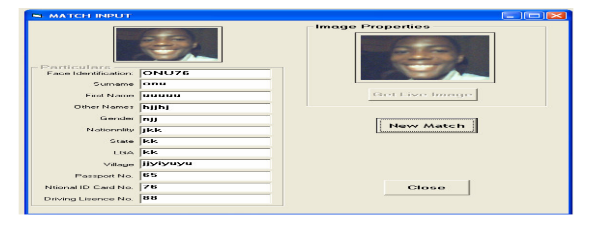
Figure 4.2 out sample of a match, access granted